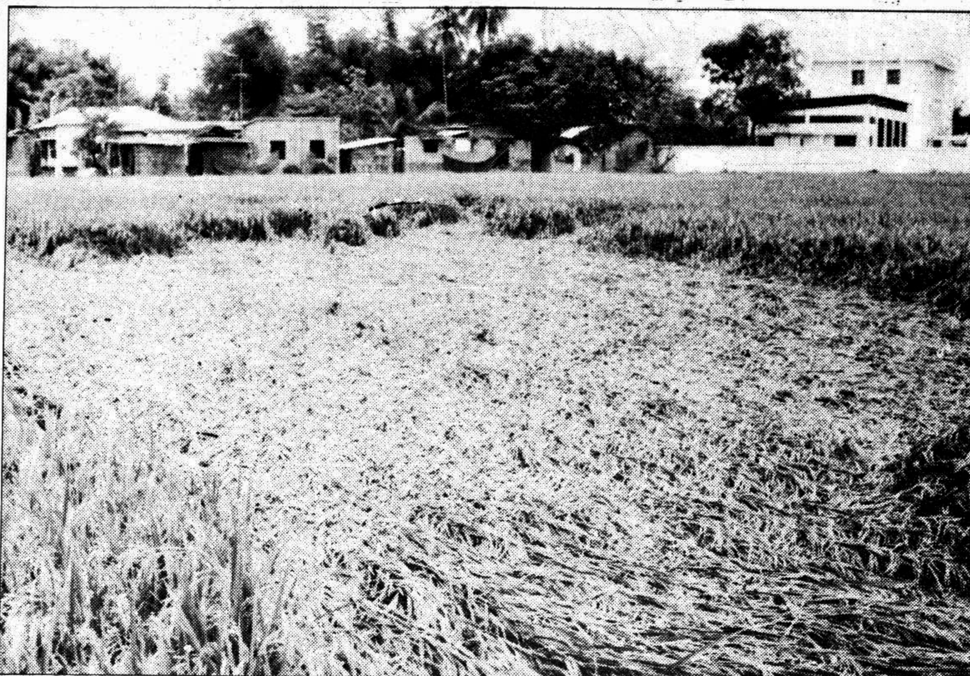
NATORE: A norwester lashed over Natore sadar, Shingra, Boraigram and Gurudaspur thanas recently damaging standing Boro crops on a vast tract of land. However, on the day the first shower of the season brought relief for the local people. Photo shows a damaged crop field of Shingra thana.