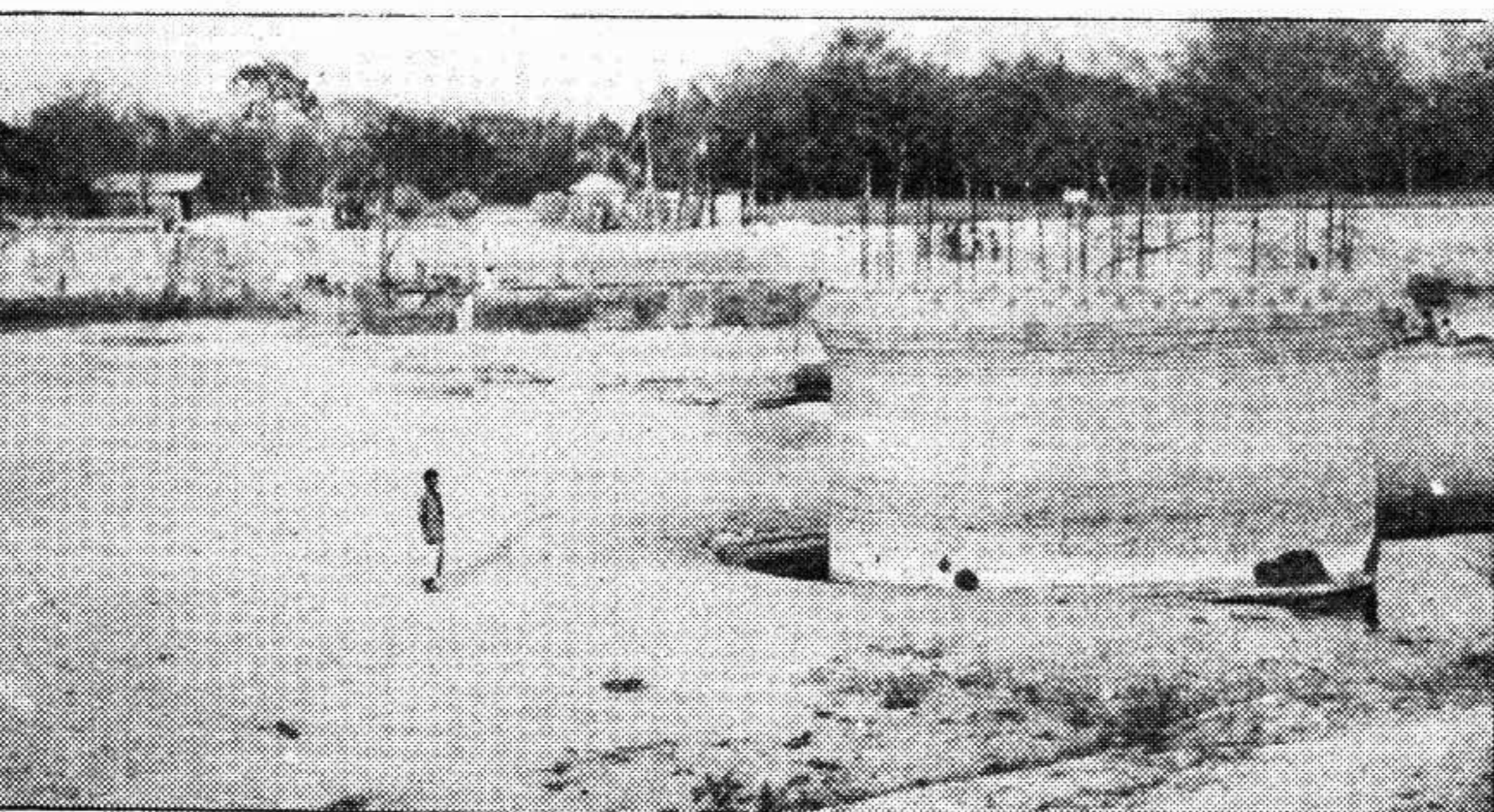
GAIBANDHA: Barodah Bridge on the river Karotoa has remained incomplete for the last three years. The bridge will connect Gaibandha with Bogra via Gobindaganj reducing its distance by 20 kilometres.