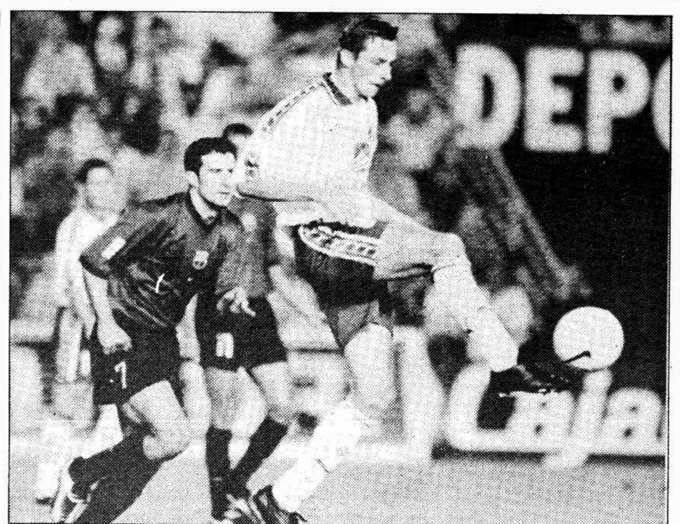
Tenerife's Yugoslav booter Slavisa Jokanovic (R) taking control of the ball while Barcelona's Portuguese superstar Luis Figo watches during their Spanish Primera Liga clash at Tenerife on April 10. Barca won 3-2.

The Canaries, who had not won in their last five games, looked tentative throughout but scored in each half through Olivier Monterrubio in the 29th minute and Yves Deroff in the dying minutes of the match.