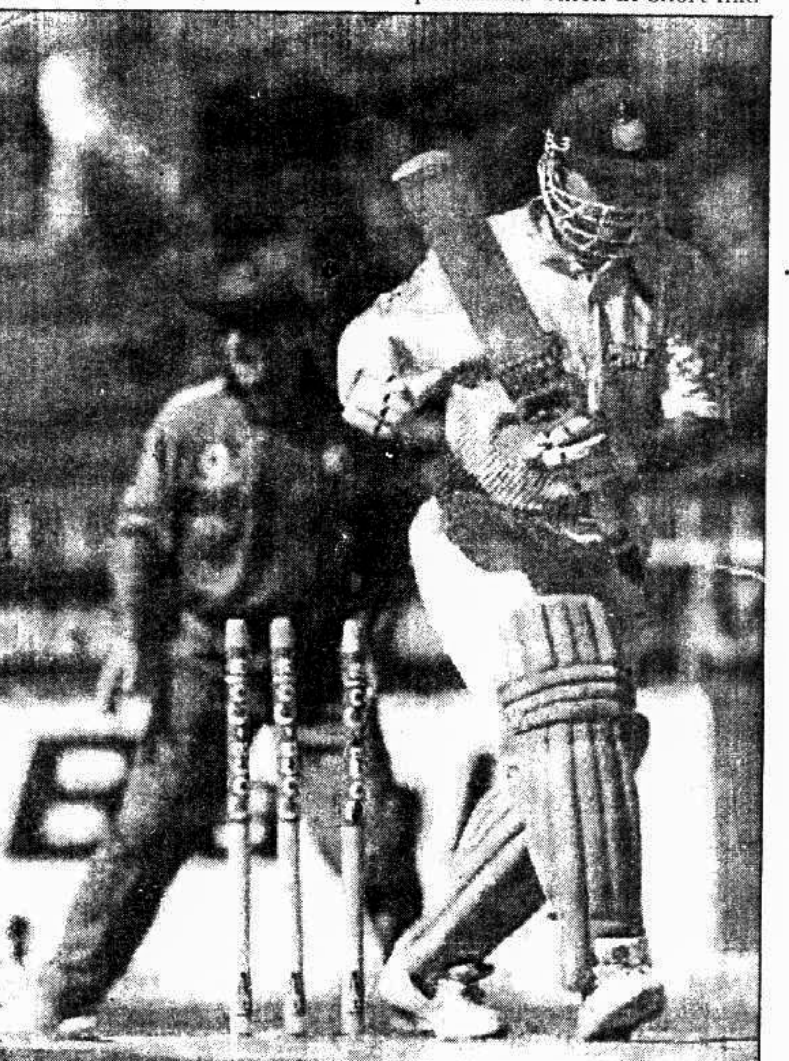
Saurav Ganguly, the Indian opener, returns to the dressing room after being bowled by England pacer Darren Gough at Sharjah yesterday.

India slipped to 61-3 by the 20th over before Dravid and the promoted Jagavallu Srinath revived them with a run-a-ball stand of 59 for the fourth wicket. Srinath, sent in at number five, hit a bold 28 off 29 balls to lend badly-needed momentum to the Indian batting. Graham Hick, who took a fine catch running back from mid-off to remove Vinod Kam-bli, also chipped in with an easy return catch off Srinath.