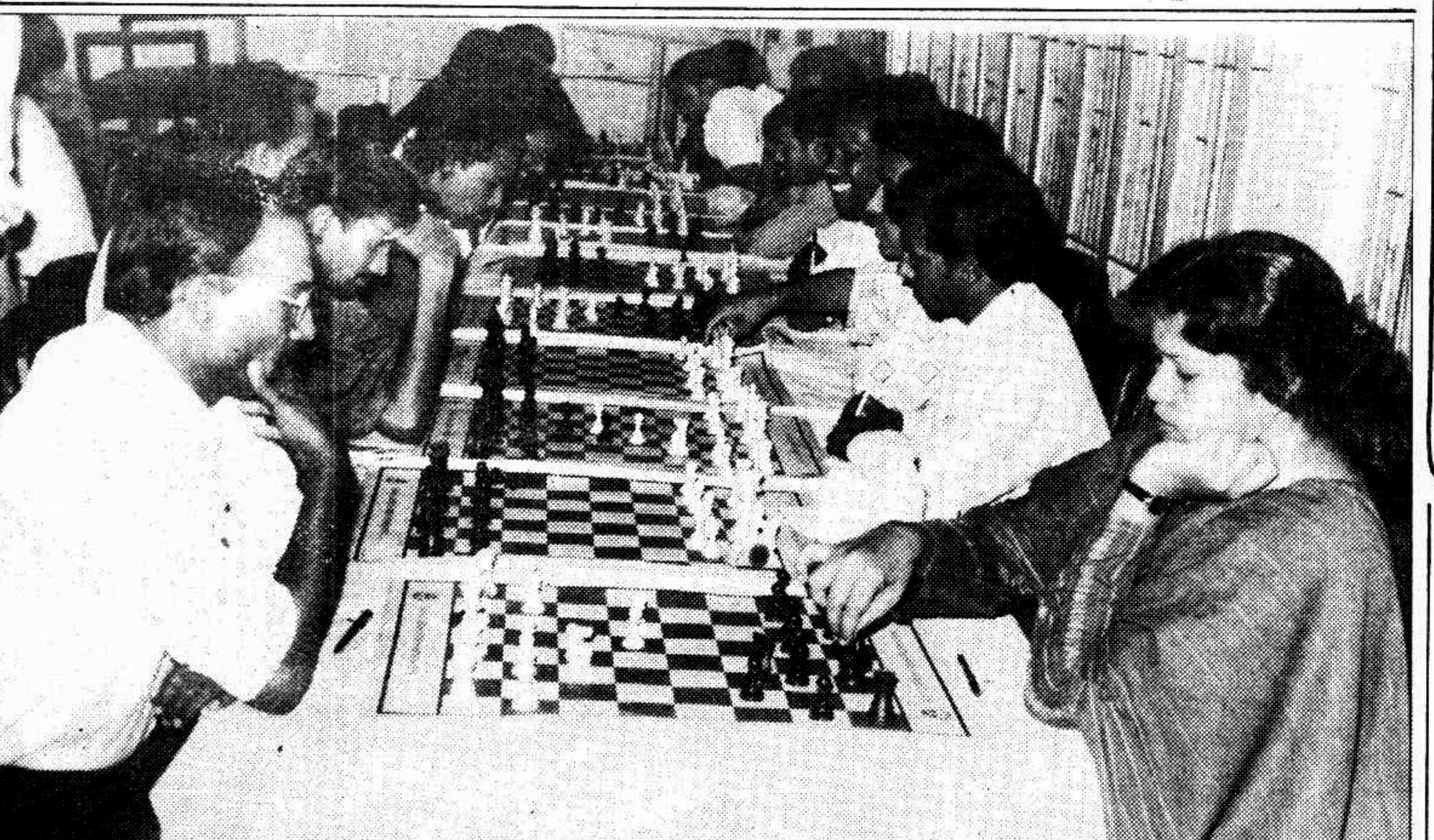
Scene from yesterday's 25th national chess championship qualifiers at the NSC.

had become an even more valuable member of Australia's limited-overs team in recent years. "I think I've done pretty well and my record in the one-day format speaks for itself," said Warne, who has taken 169 wickets from 108 one-day international appearances. "I've had a pretty good career so far. I'm not looking to finish my one-day career, that's for sure, and I think in the last few years I've learned how to bowl in one-day cricket." "The first four or five years I played one-day cricket I basically just bowled leg breaks and