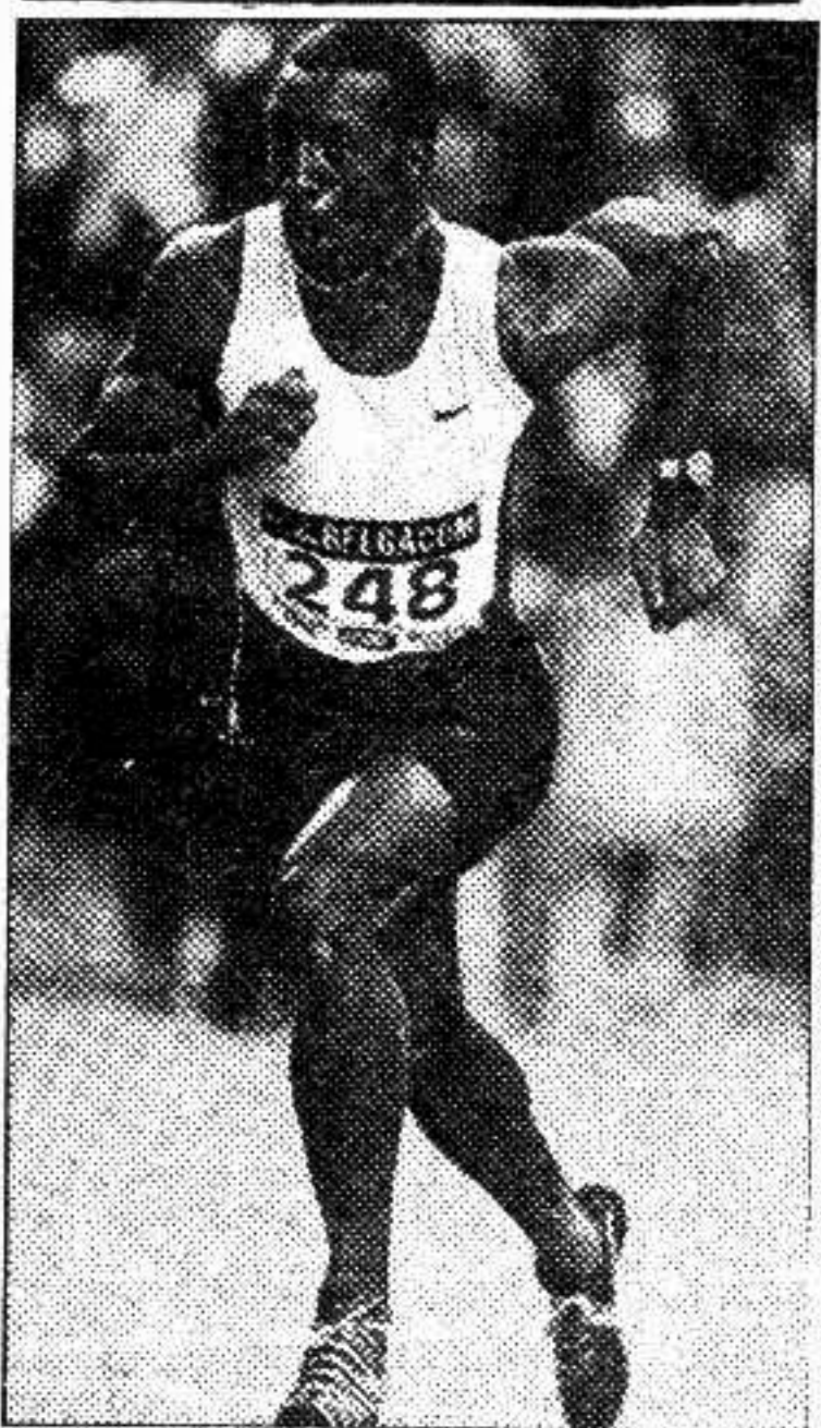
Michael Johnson (Double Olympic champion) "I hope to end the season ranked number one."