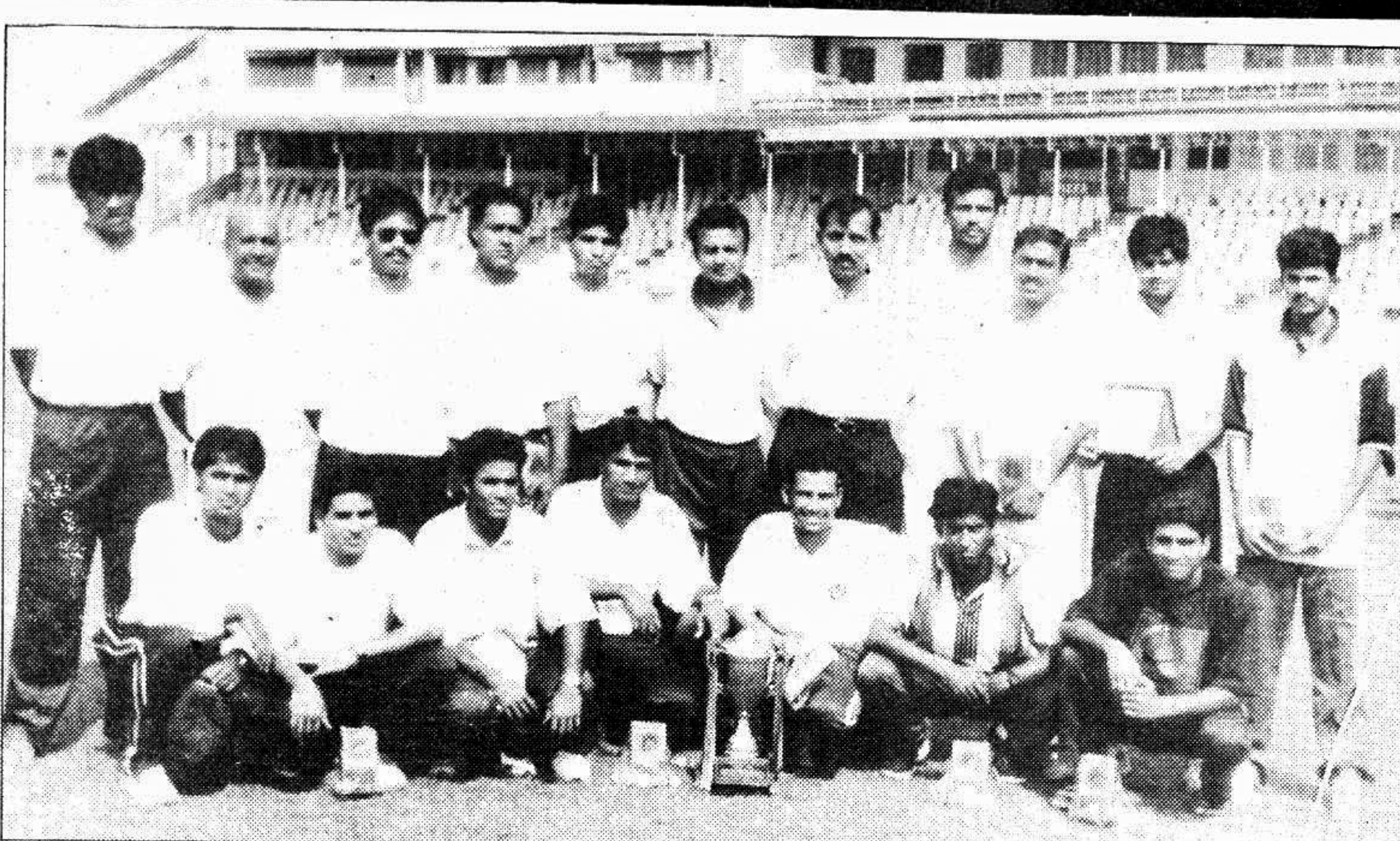
Players and officials of Bangladesh Biman, the newly-crowned national cricket champions.