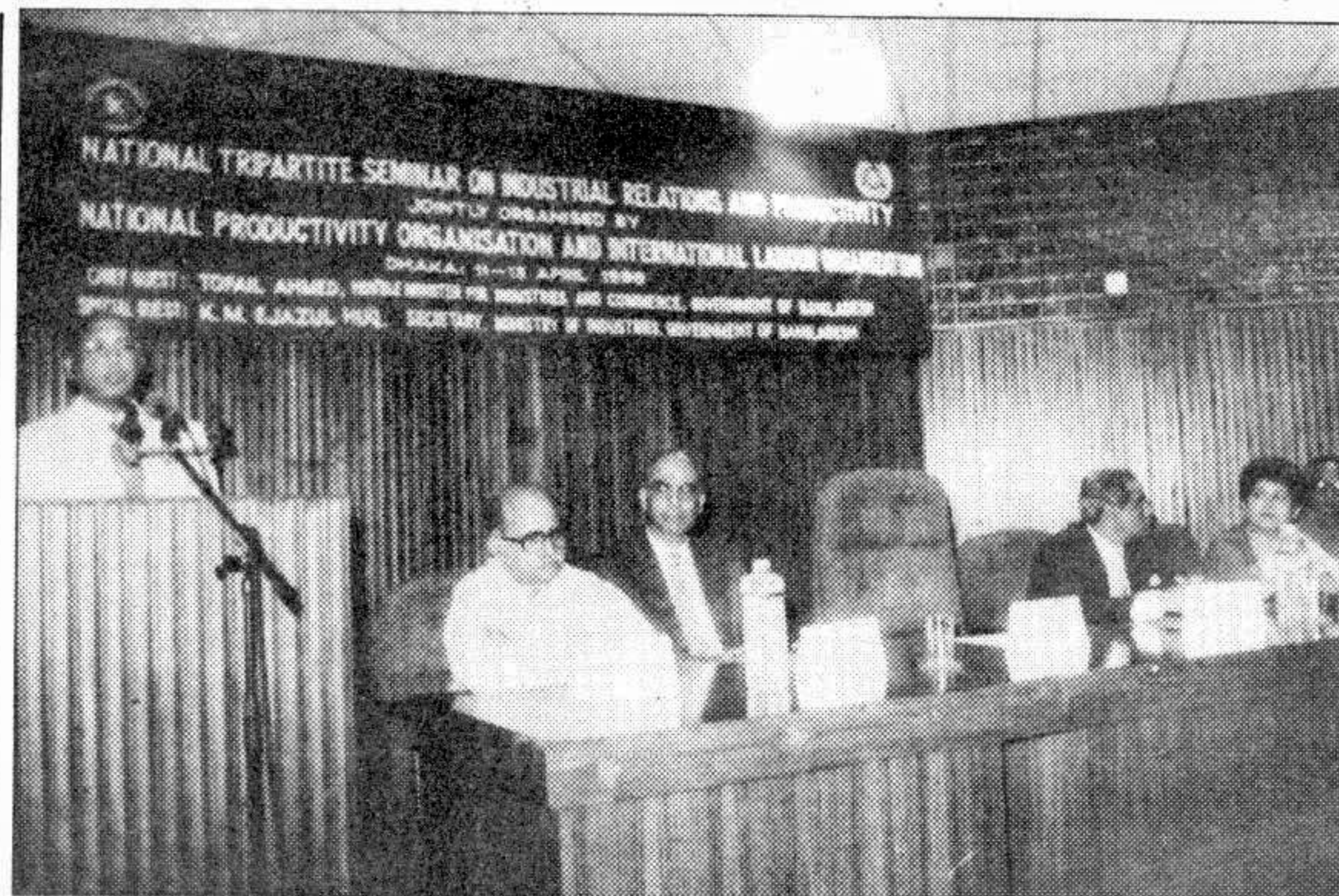
Tofail Ahmed, Minister for Commerce and Industries addressing a seminar on Industrial Relations and Productivity at IDB conference room in the city yesterday.