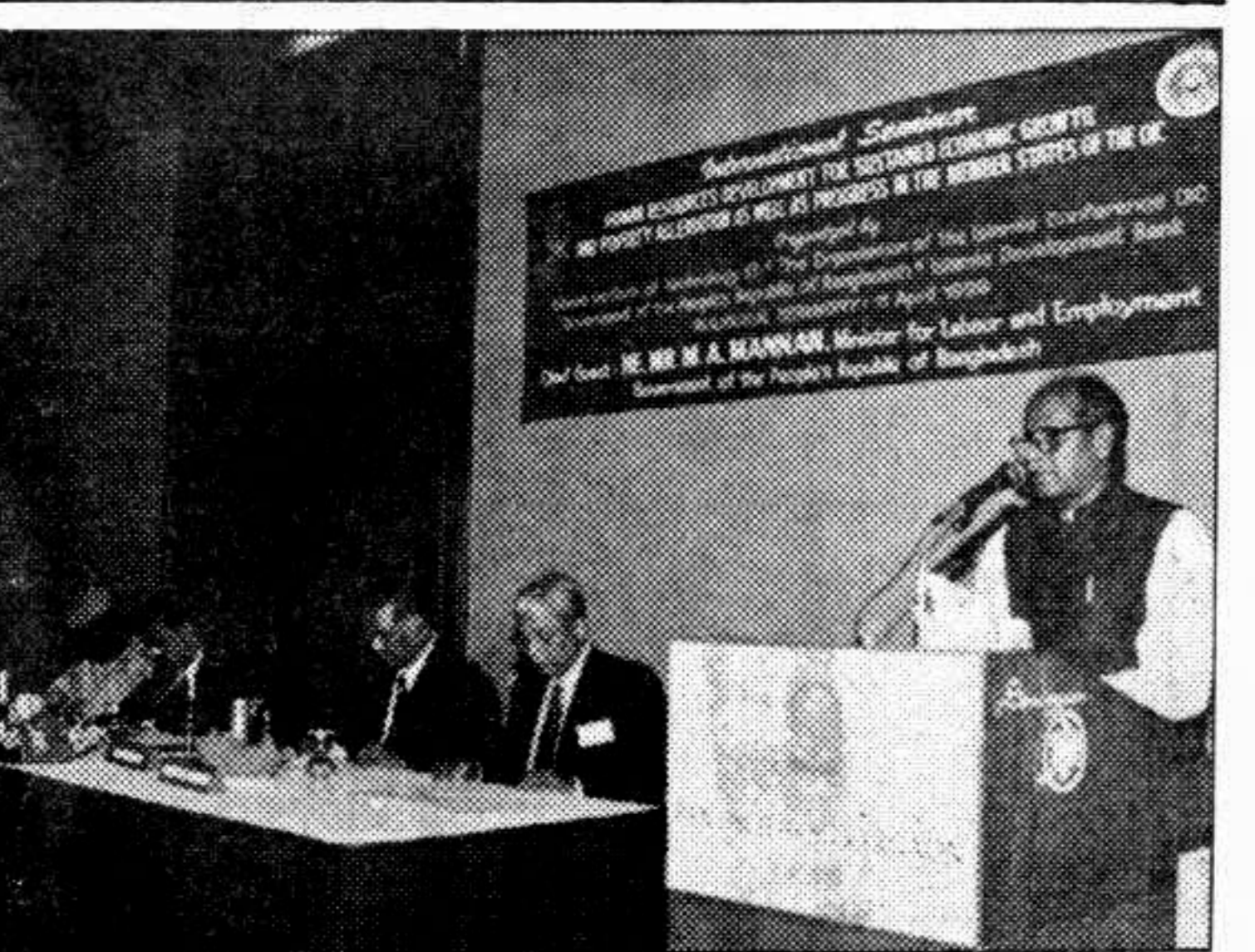
Abdul Mannan, Minister for Labour and Employment speaking at an international seminar yesterday on 'Human Resources Development for Sustained Economic Growth and Poverty Alleviation as well as Progress in the Member States of OIC' organised by the Islamic Institute of Technology (IIT), the Organisation of the Islamic Conference (OIC) in collaboration with govt of Bangladesh and Islamic Development Bank (IDB) at Hotel Sonargaon in the city.