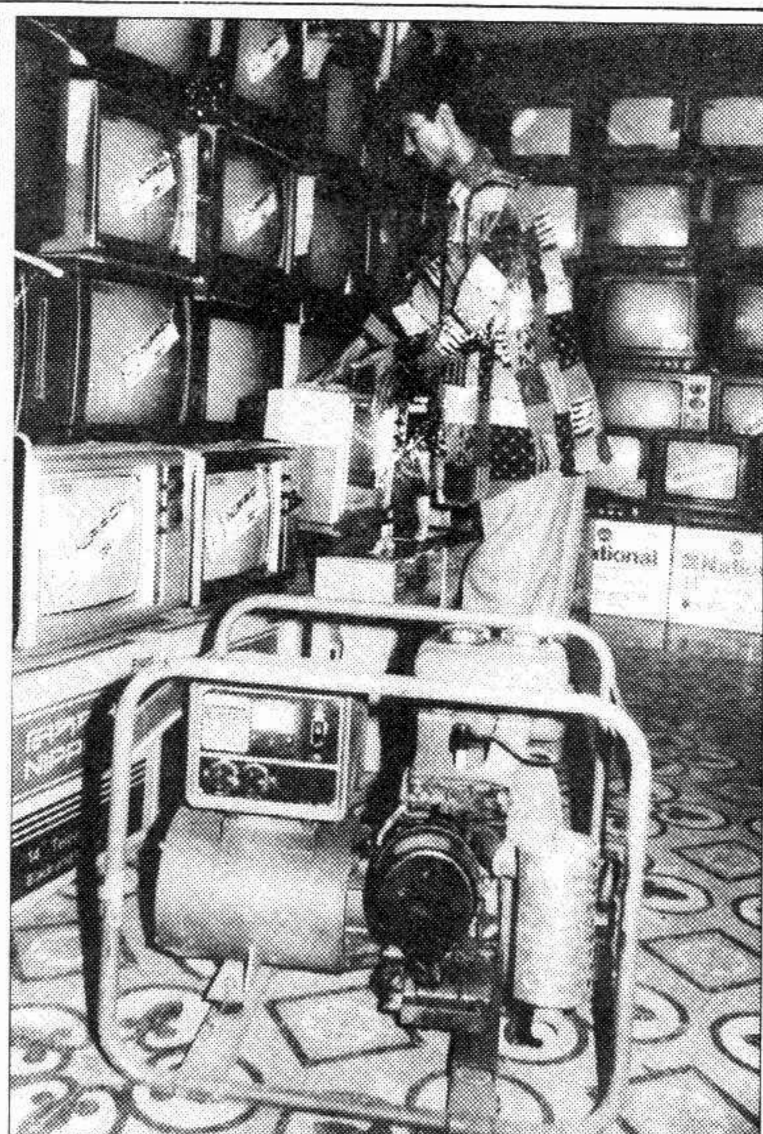
To cope with the unprecedented load-shedding of electricity now prevailing in the city, the shopowners in different markets are busy installing generators in their business establishments. This picture was taken yesterday from the Baitul Mukarram Electronics Market.