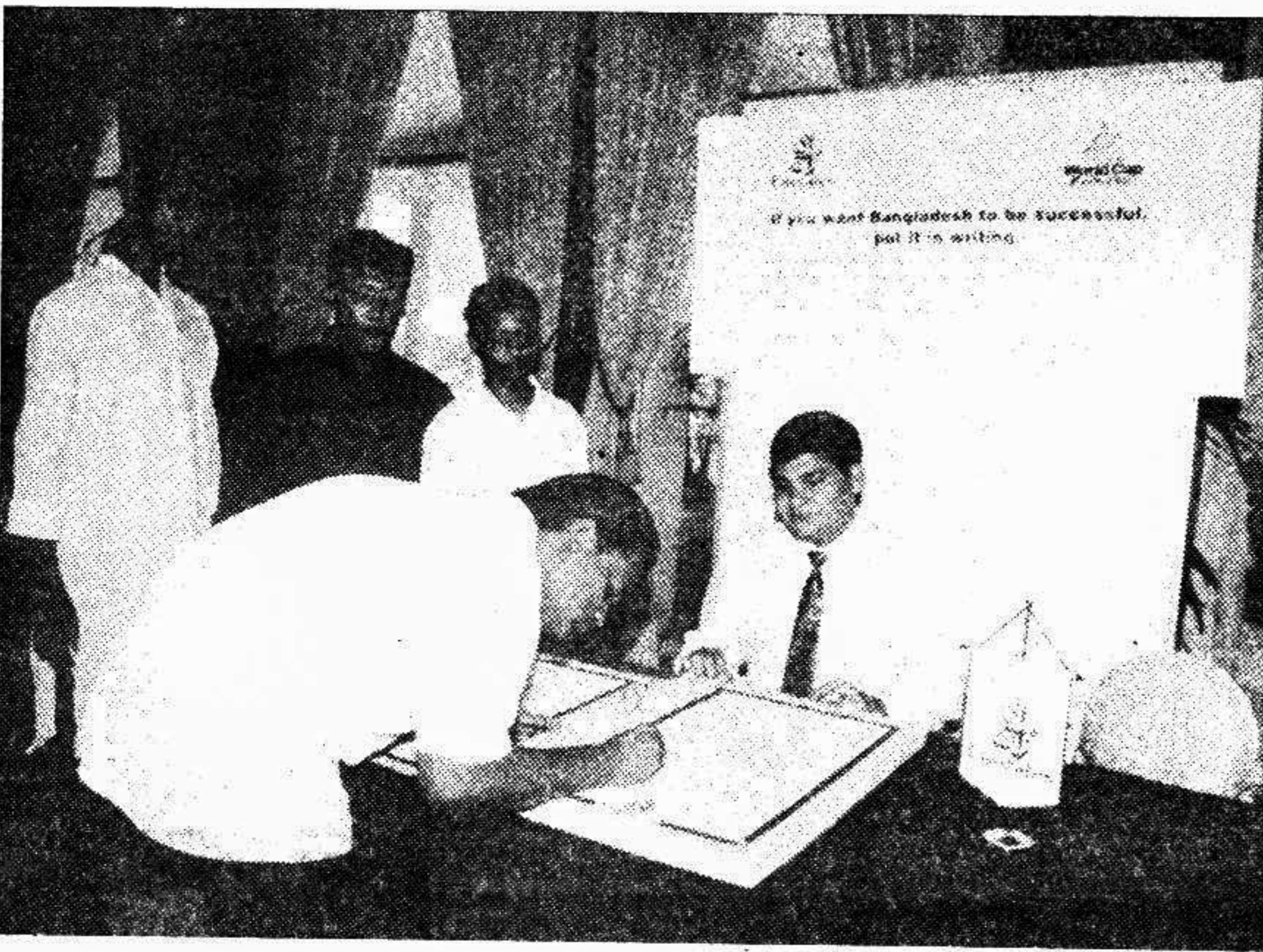
Enthusiastic people from all walks of life are inscribing their good wishes for success of the Bangladesh Cricket team in the forthcoming Cricket World Cup in the "Good Luck Bangladesh" book launched by Emirates Wednesday at Dhaka Sheraton Hotel and Emirates offices in Dhaka, Chittagong and Sylhet and at Rajshahi Tennis Complex. The book will be kept open till 8 pm on April 13. The 'Good Luck Bangladesh Book' will be presented to the captain of the Bangladesh team prior to their departure for England.