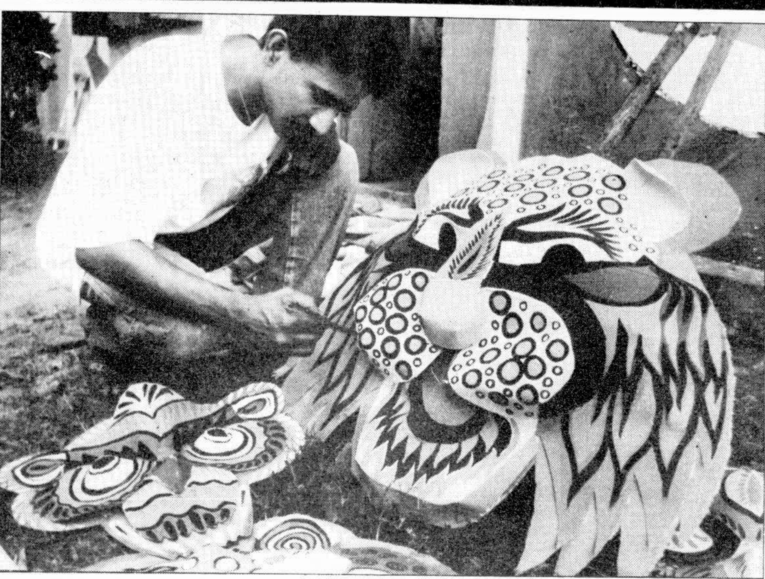
Pahela Baishakh, the first day of the Bengali new year 1406, is only a day away. A student of the Institute of Fine Arts of Dhaka University paints masks yesterday as part of preparations for the traditional procession to be brought out to celebrate the day.

A red carpet reception will be accorded to Chairman of the National People's Congress of China Li Peng when he arrives in the capital today. A special aircraft will carry the Chinese leader to Zia International Airport at 2.20 pm on a two-day official visit to Bangladesh. He will lead a 120-member delegation. Li Peng, now on a six-nation tour, is coming from Pakistan after visiting Turkey, Greece and Syria. He will leave Dhaka tomorrow for Bangkok. On arrival at ZIA, he will be received by Prime Minister Sheikh Hasina and Speaker Humayun Rashid Chowdhury. He will be presented a guard of honour. He will then be driven straight to the Jatiya Smriti Soudha at Savar. Li Peng is one of the most important visitors to Bangladesh. See Page 12 Col 4