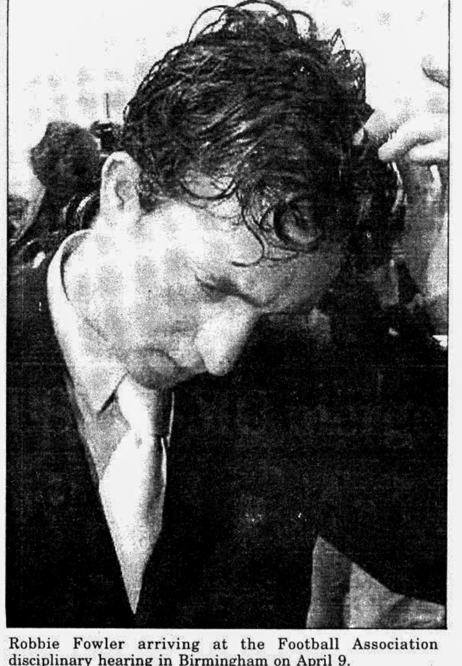
Robbie Fowler arriving at the Football Association disciplinary hearing in Birmingham on April 9.