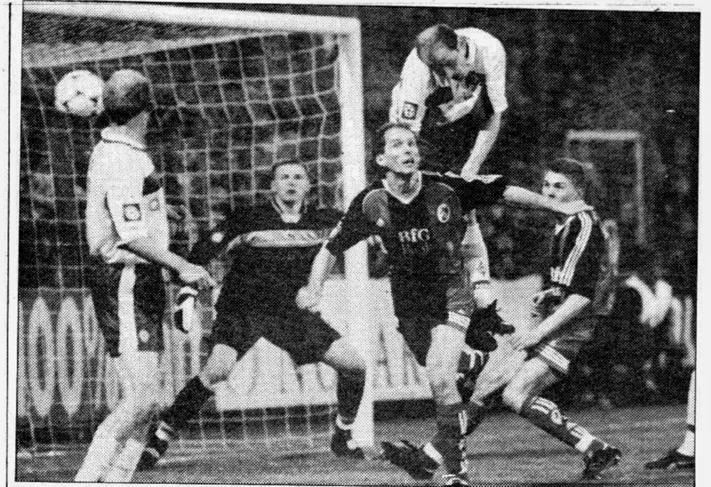
A goalmouth melee during the Bremen-Freiburg clash of the Bundesliga at Freiburg on April 9.