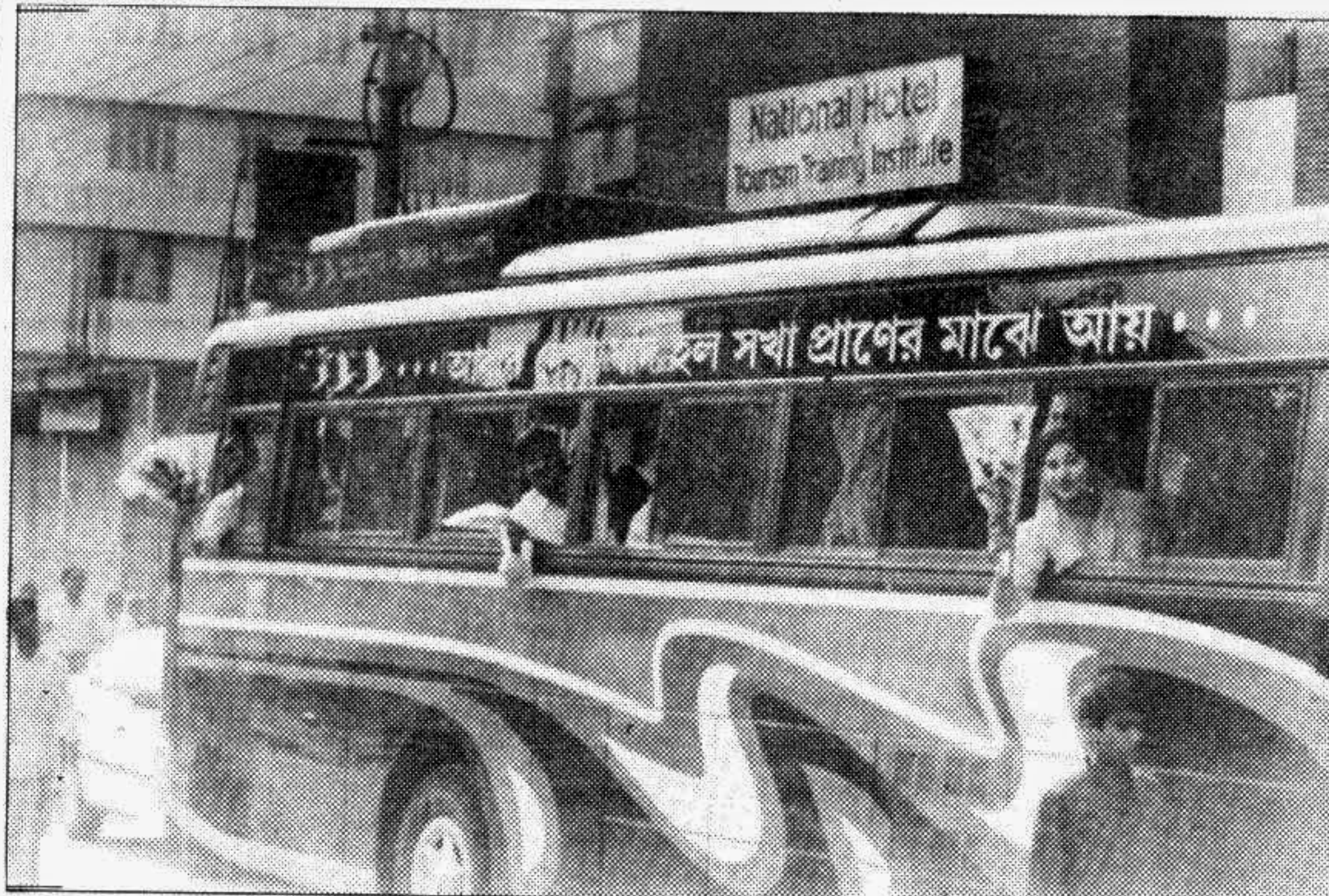
The Indian bus from Calcutta on trial-run left the city yesterday for their journey back home. Commercial bus services on the Dhaka-Calcutta route is set to begin in a few weeks time.