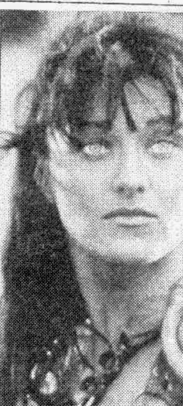
Xena on Star World at 6.00 pm today.

6:00 Spiderman 6:30 G1 Joe 7:00 Crystall Maze 8:00 Mr Belvedere 8:30 Nanny And The Professor 9:00 The Good Life 9:30 Murder Most Horrid 10:00 TV Com 10:30 Travel Asia 11:00 Ally McBeal 12:00 Mystery Movies - Prime Suspect "The Lost Child" 2:00 Space Above And Beyond 3:00 The Adventures of Sindbad 4:00 Hercules 5:00 WWF Shotgun Challenge 6:00 Xena 7:00 Baywatch 8:00 Lovejoy 9:00 Soldier Soldier 10:00 The Adventures of Sindbad 11:00 Xena 12:00 Hercules 1:00 Tropical Heat 2:00 Baywatch Nights 3:00 Series: Soldier Soldier 4:00 Aerobics Oz Style 4:30 World News 5:00 The Animals of Farthing Woods 5:30 Eek! The Cat