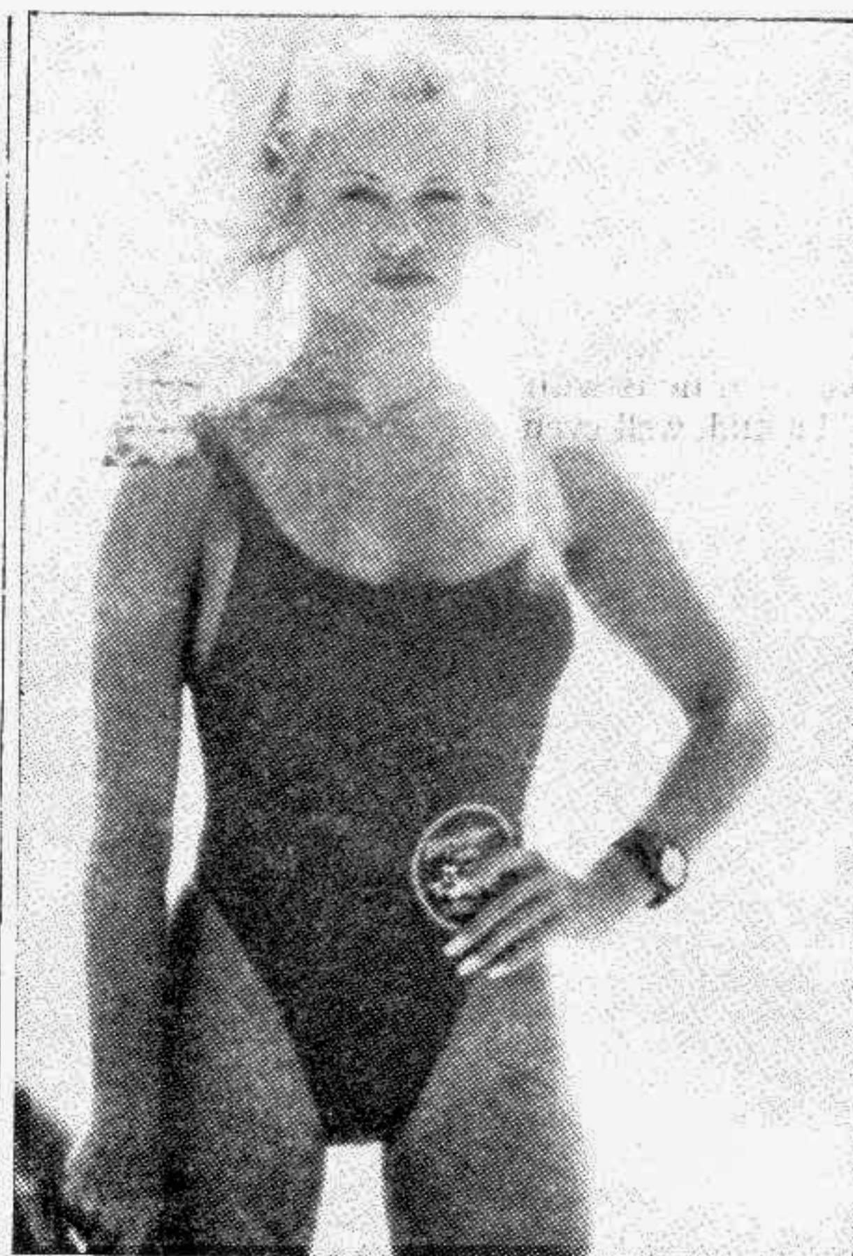
Baywatch (Series 8)

7:00 MTV Asia Hit List VJ Mike/Sarah 9:00 MTV Fresh VJ Sarah 9:30 MTV-U 10:30 Non-Stop Hits 12:30 MTV Hit Film Music 7:00 MTV Music - Full V Nalisha 1:30 MTV-U