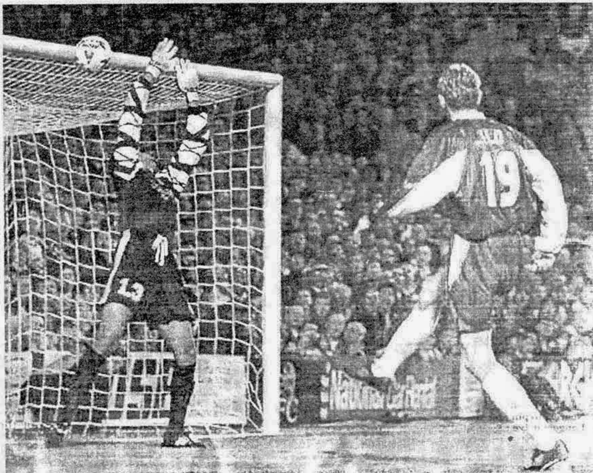
Chelsea's Norwegian international Tore Andre Flo puts the ball beyond the reach of Mallorca custodian to score the equaliser for his team during their European Cup Winners' Cup semifinal first-leg encounter at Stamford Bridge in London on April 8.

The Swede also paid tribute to Boksic. "He didn't play well for us the whole year and tonight was his only good game."