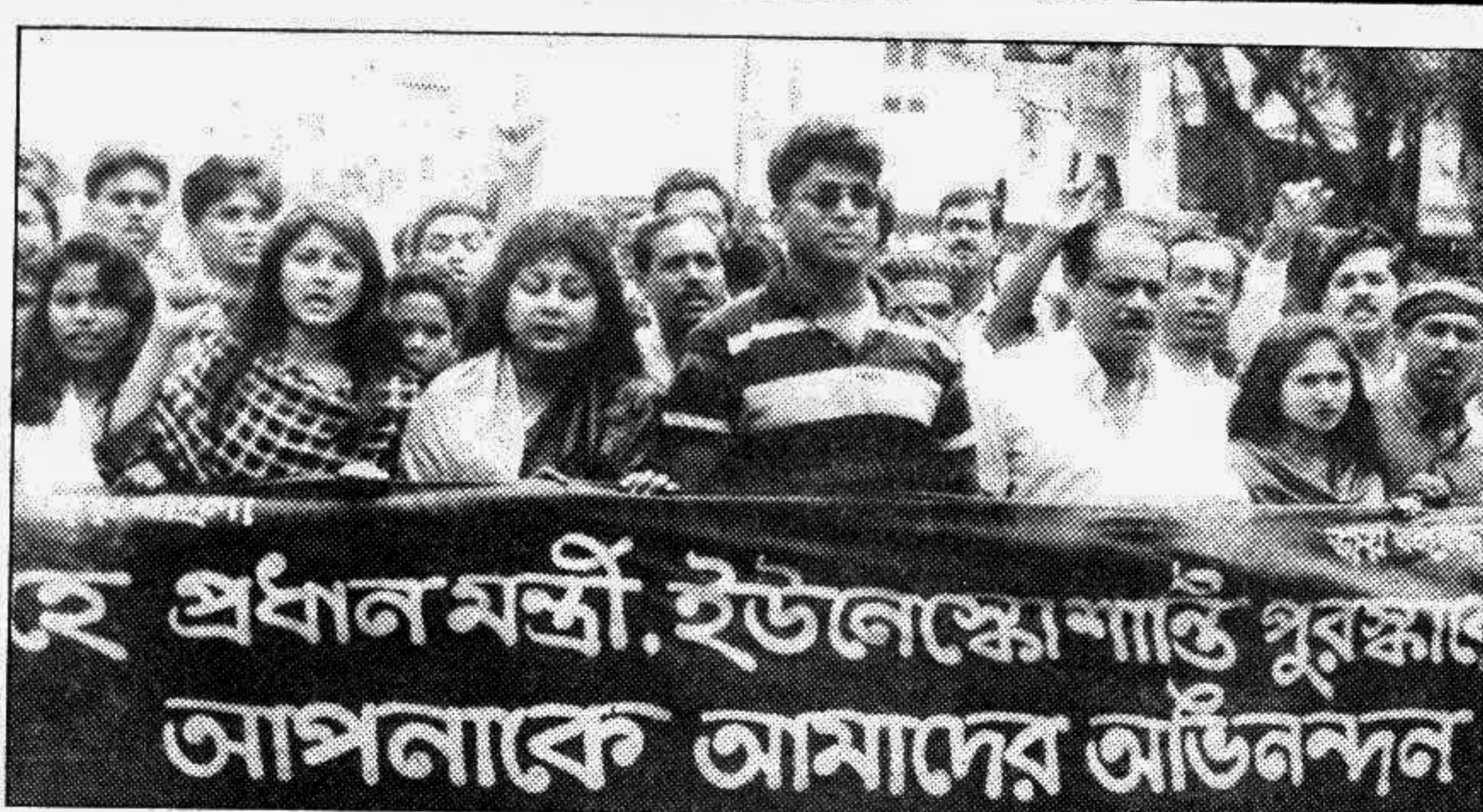
Bangabandhu Sangskritik Jote brought out a procession in the city yesterday hailing Prime Minister Sheikh Hasina on her winning the UNESCO peace prize.

He was jailed in June 1997 for influence-peddling and tax evasion, and released on bail five months later.