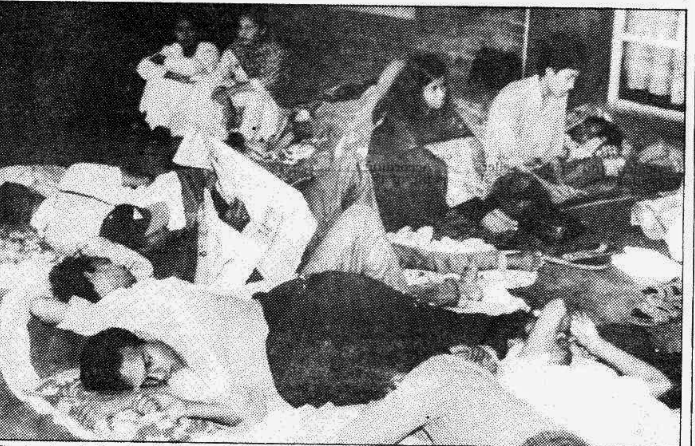
Students of the Architecture Department of BUET on the third day of their fast-unto-death programme at noon yesterday. Later in the evening they withdraw their programme following requests from eminent citizens of the country.

Joarder said, the PHED needs more equipment to de-arsenic.