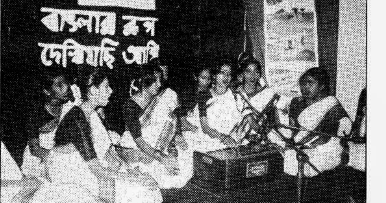
Students of Maple Leaf International School performing a number at a cultural programme, "Banglar roop dekhiachi ami" featuring the seasons, at the school auditorium recently.

She said it would be a good idea to introduce health warnings for alcohol similar to those issued for tobacco.