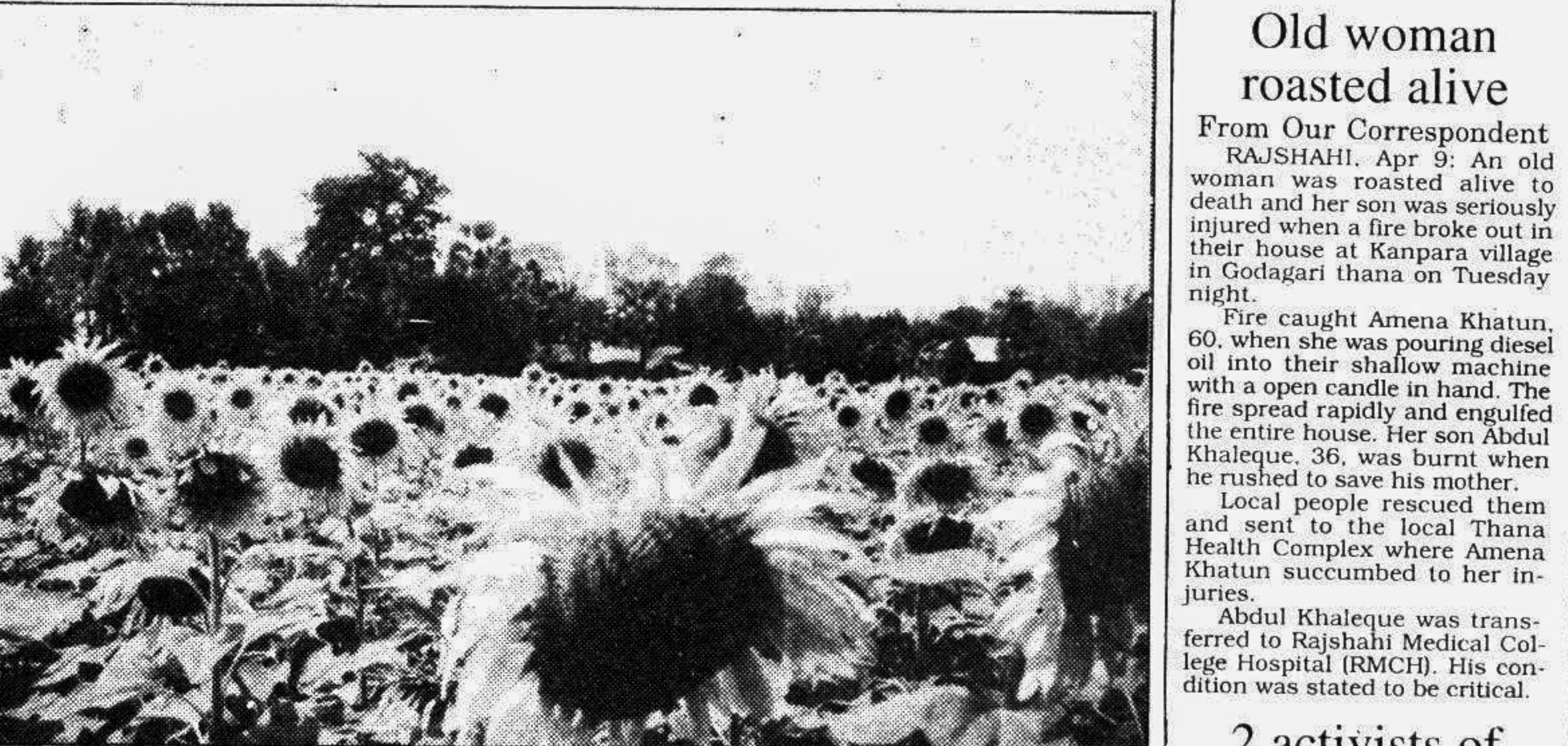
MAGURA: Sunflower cultivation has become very popular among the local farmers. Photo shows a field of sunflower in full bloom at village Uluberia here.

APB from Patuakhali reports: A 3,000-ton fertiliser godown at Barguna Sadar thana has been lying unused for at least 15 years but its staff are drawing Tk 20,000 as salaries per month for no work. The godown was constructed at a cost of Tk 1.27 crore to help dealers of Amtali, Betagi, Patharghata, Mirzaganj, Kalapara, Mathbaria and Barguna Sadar thanas to store fertiliser. The godown is in an abandoned condition now in absence of maintenance and repair, they said.