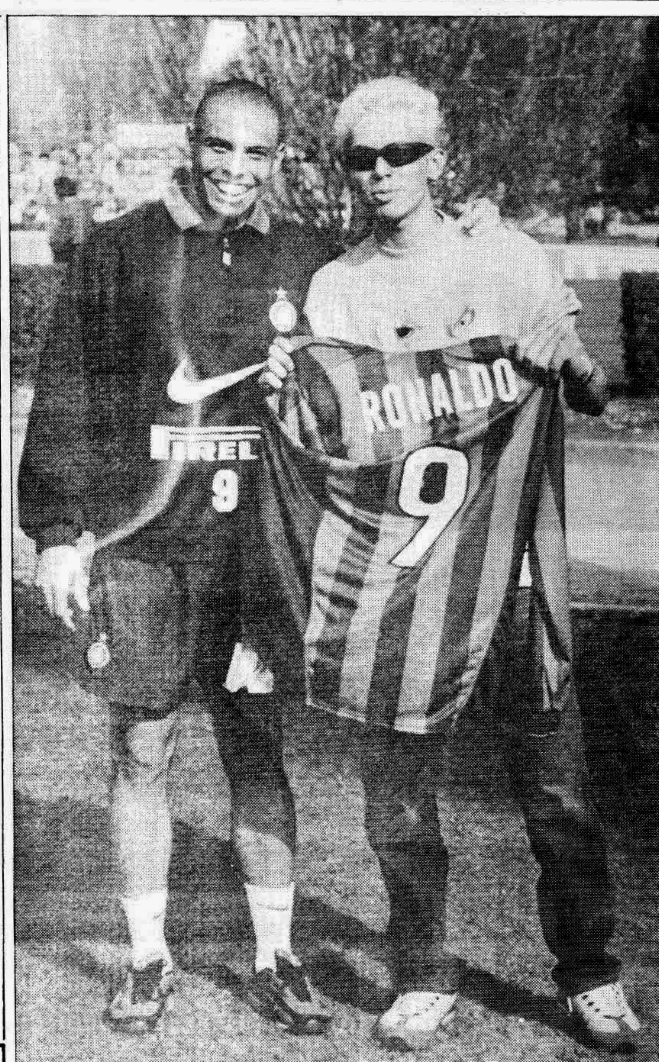
125cc motorcycle world champion Valentino Rossi (R) shows a number nine Inter Milan jersey presented to him by superstar Ronaldo at Inter's training ground in Appiano Gentile on April 6. Rossi was on a visit to the soccer giants' headquarters.

"Mentally the second leg will be very different from tonight, we can expect a tense game, it's still quite a long way to Moscow."