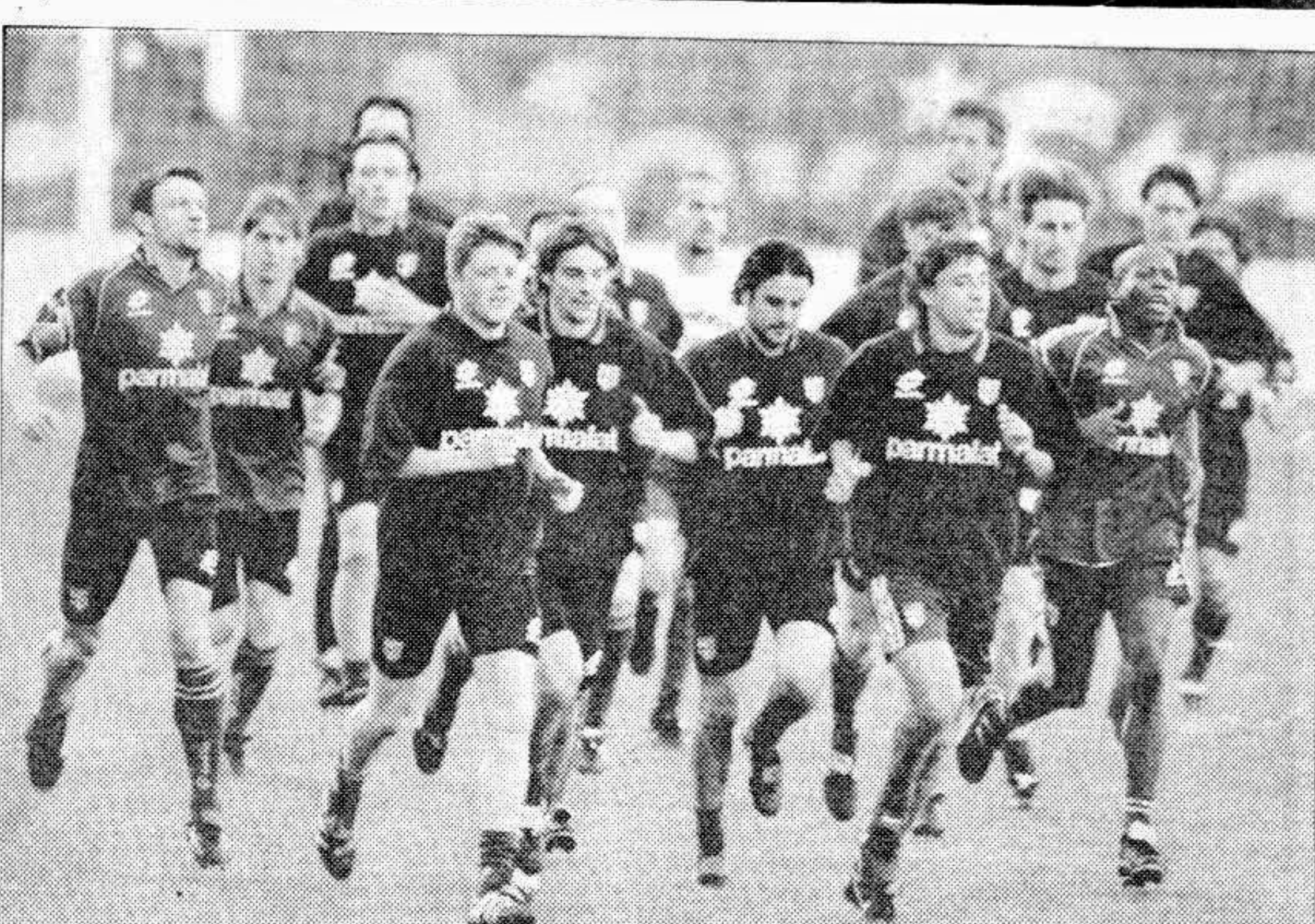
Parma players warming up during a training session in Madrid ahead of their UEFA Cup semifinal first leg match against Atletico Madrid in Madrid on April 5.

But a decision was made two years ago to guarantee the US a home tie in Boston to commemorate the competition's centenary at the site where it began.