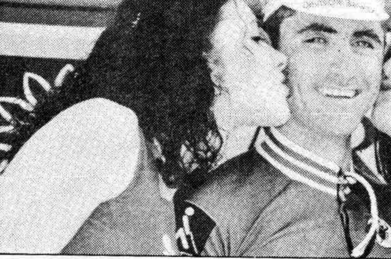
Frenchman Laurent Jalabert gets a congratulatory kisses from two attendants after winning the first stage of the Basque Country cycling race at Tolosa, Spain on April 5.

"We're looking at Pakistan, Australia, Britain, India and the West Indies," he said. "And I think we will do okay."