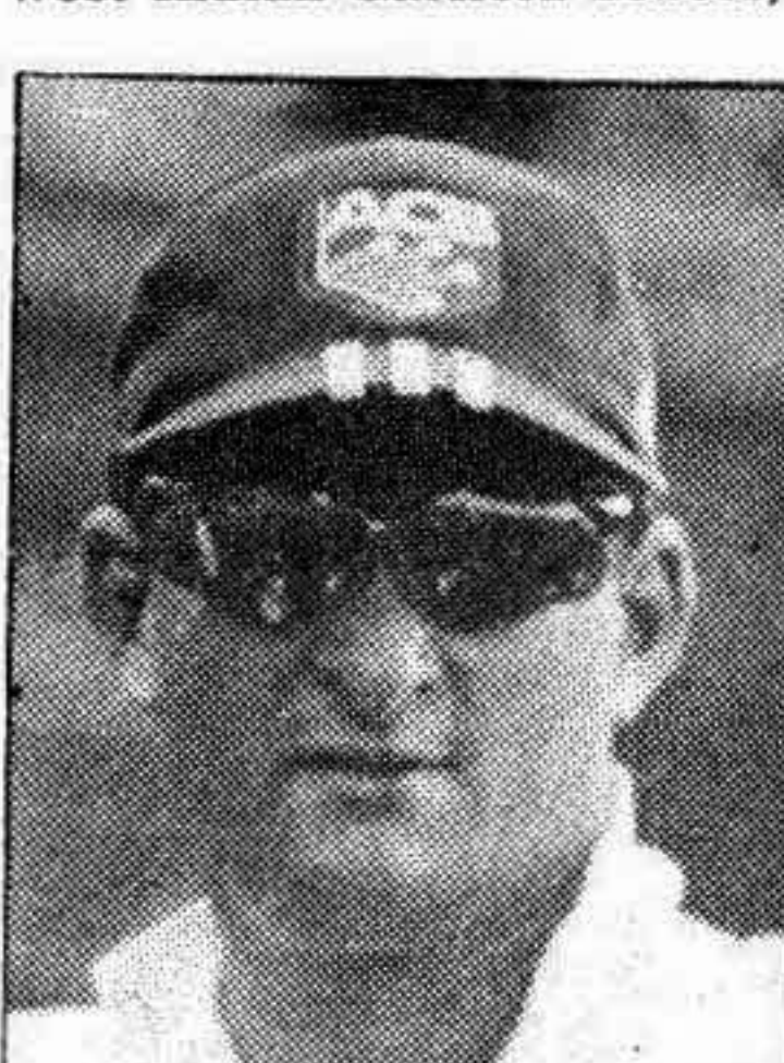
M WAUGH ... 60 n.o

before McGrath's fast, flat and accurate return from fine leg found the batsman a yard short as he sought a second run to keep the strike. It was the 10 time in 80 matches that Guyanese has fallen by the run out route. Only former Australian captain Allan Border, 12 times in 156 matches, and fellow West Indian Garfield Sobers, before McGrath's fast, flat and accurate return from fine leg found the batsman a yard short as he sought a second run to keep the strike. It was the 10 time in 80 matches that Guyanese has fallen by the run out route.