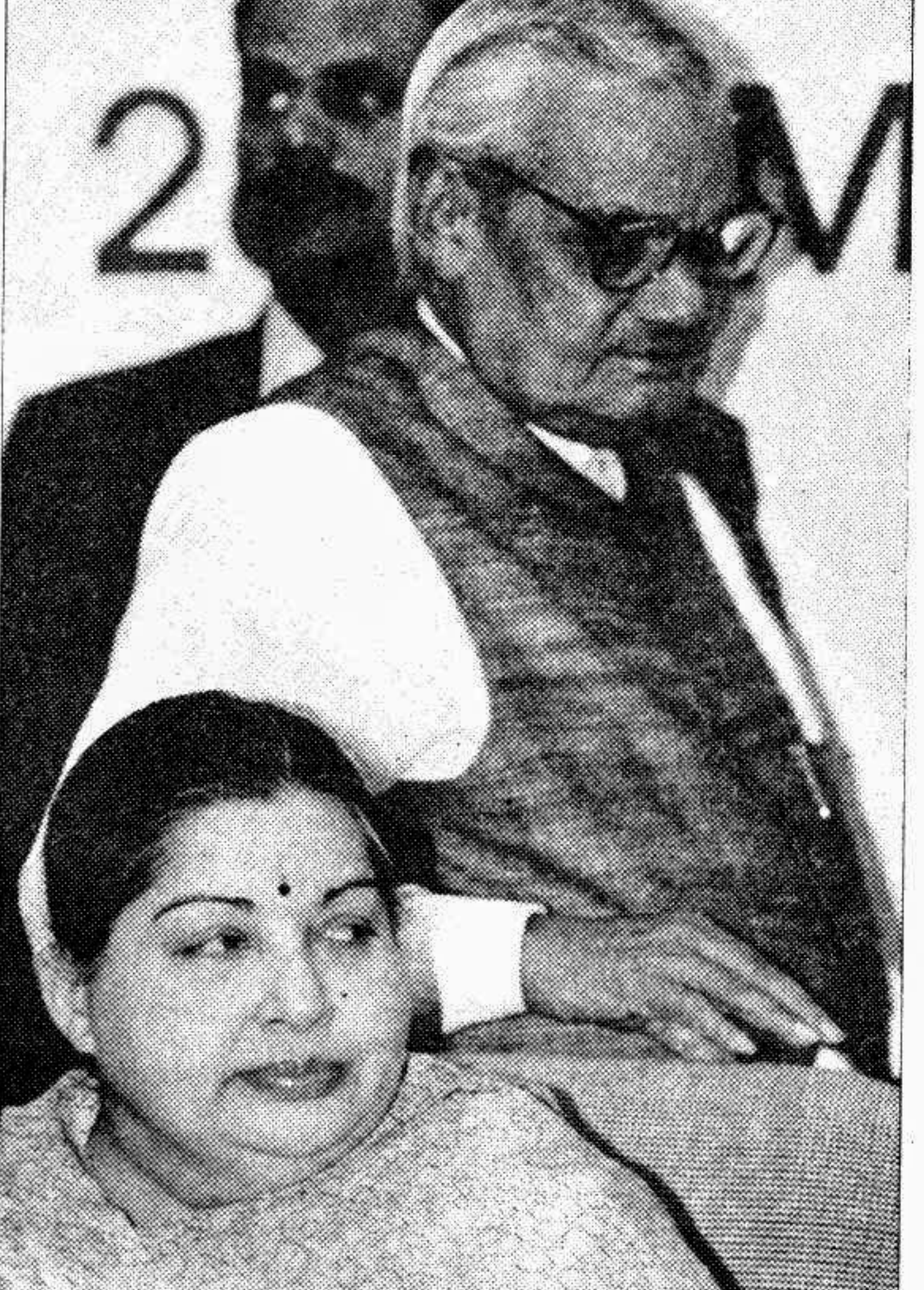
AIADMK leader Jayalalitha Jayaram sitting as Indian Prime Minister Atal Behari Vajpayee walks behind after finishing his speech during a function in New Delhi on March 26.