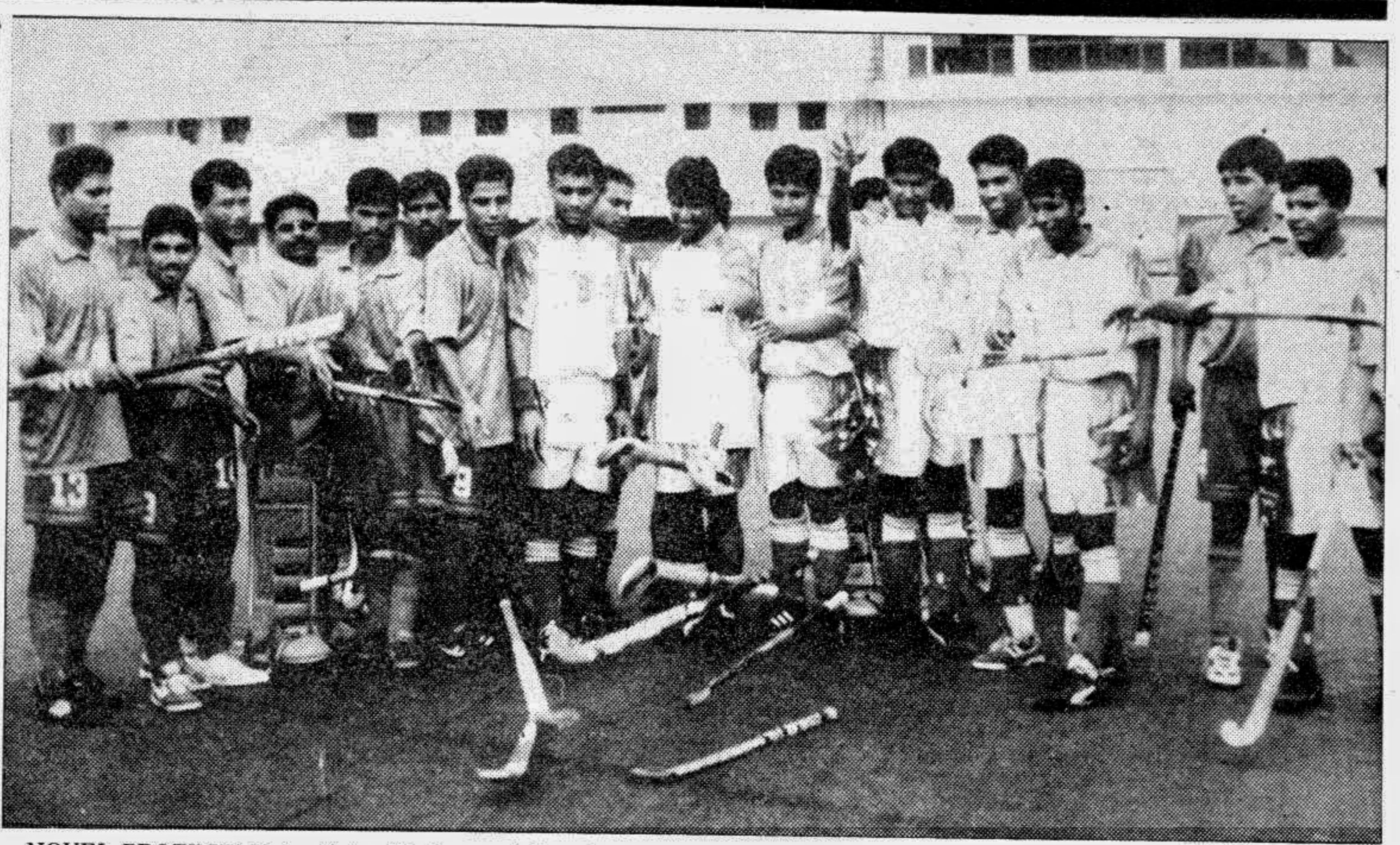
NOVEL PROTEST! Usha Krira Chakra and Farashganj Sporting players throw their sticks to express their indignation at the umpires who left the ground, although they were ready to play at the Moulana Bhasani Stadium yesterday.

A meeting of the league committee was going on till our filing of this report late last night.