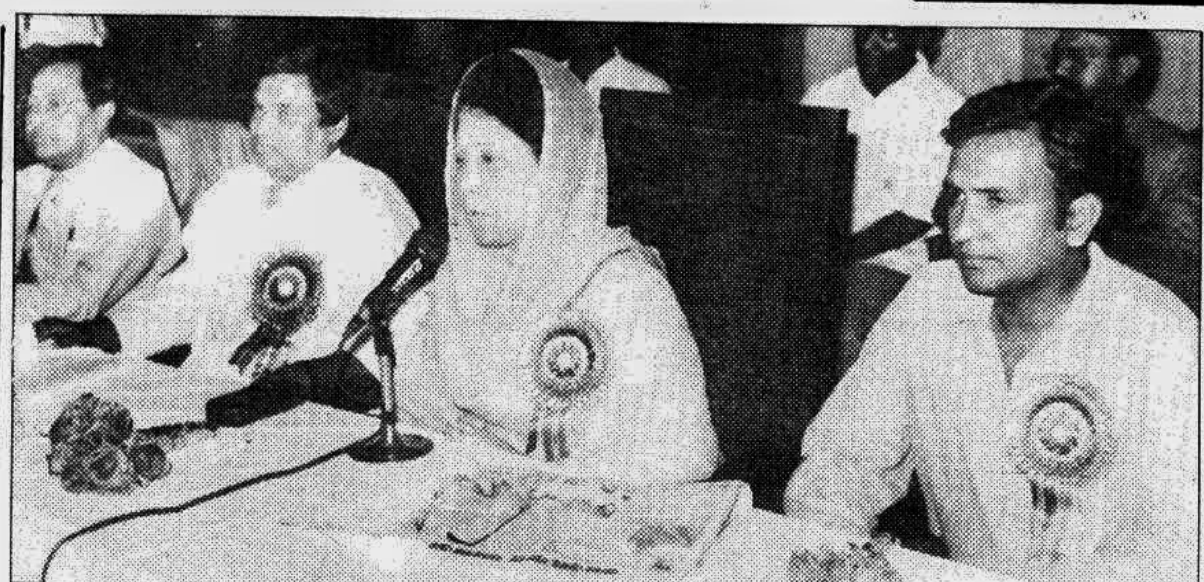
BNP chairperson and Leader of the Opposition in Parliament Begum Khaleda Zia addressing an extended meeting of Jatiyatabadi Chhatra Dal (JCD) at the auditorium of the Institution of Engineers in the city yesterday.