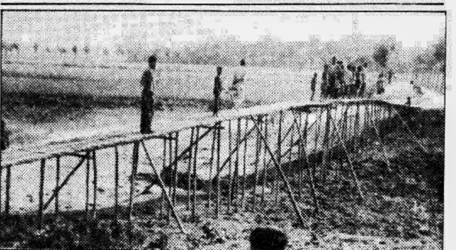
GAIBANDHA: Local people have been demanding for a long time a concrete bridge instead of this bamboo bridge connecting between Rakhon Bruze union and Gobindaganj thana sadar.

Some consumers alleged that police, bureaucrat and the authorities remain silent in this regard as they get it at lower rates.