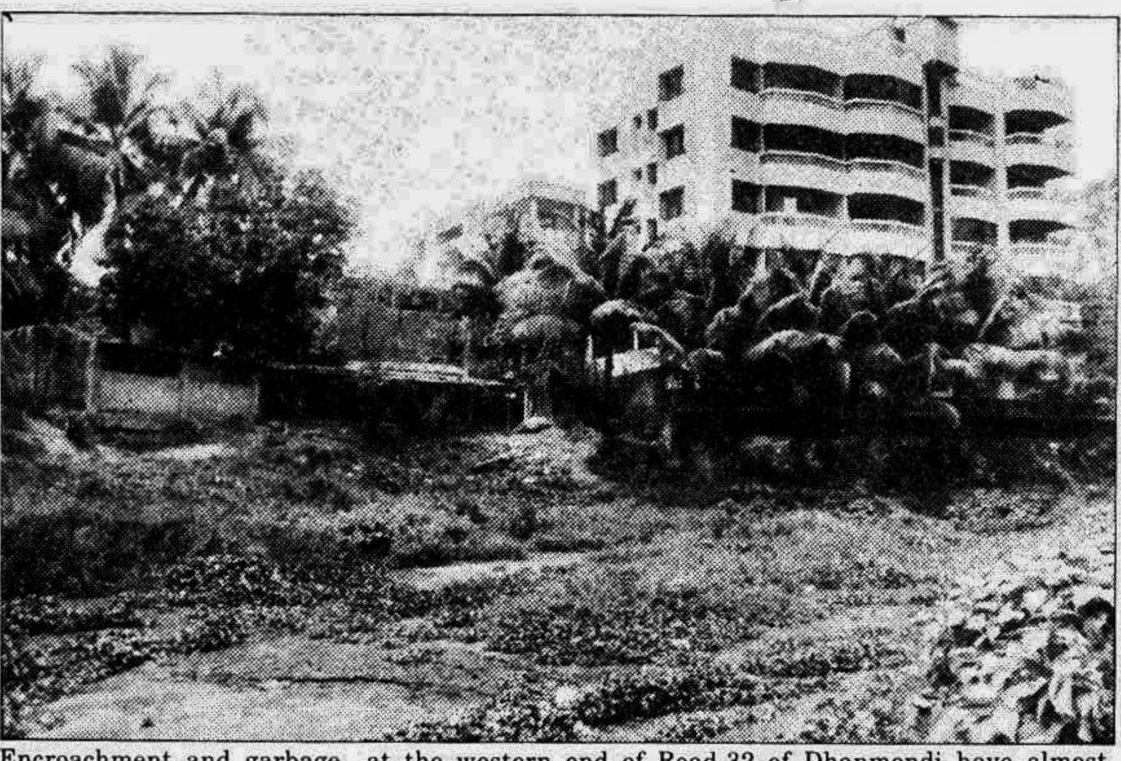
Encroachment and garbage at the western end of Road-32 of Dhanmondi lake development work.