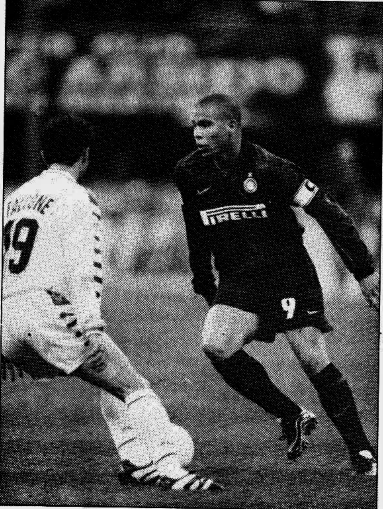
REDISCOVERING THE TOUCH: Superstar Ronaldo (R) tries to outwit a Fiorentina defender during Inter Milan's Serie A fixture at the San Siro on April 3.

consecutive match. Supported by a partisan crowd of 75,000, Lazio attacked throughout but clashed uselessly against Milan's defensive wall. The Milan team seemed willing to defend its third place in the standings, which would earn it a place in next season's Champions League, rather than narrow its gap with the league