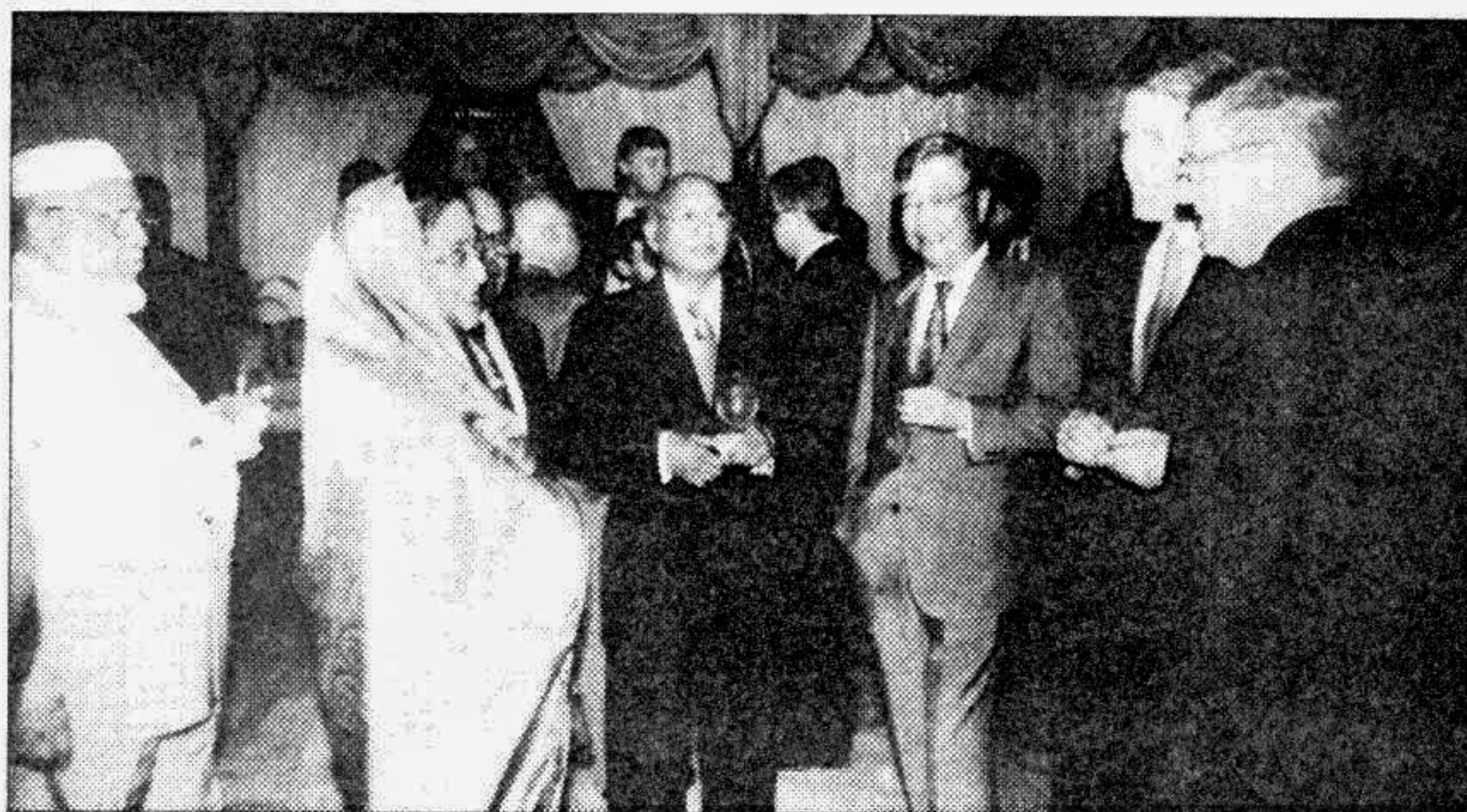
Prime Minister Sheikh Hasina at a dinner she hosted yesterday in honour of the ambassadors and representatives of donor countries and agencies at Ganobhaban.

Published by the Editor from City Publishing House Ltd., 90 Kakrail, Dhaka-1000 on behalf of Mediaworld Ltd., 52 Motiheel C.A., Dhaka-1000. Editorial, News & Commercial Offices: House No. 11, Road No. 3, Dhanmandi R/A, Dhaka-1205. PABX: 866772-4, Commercial: 866771, Fax No: 88-02-863035, GPO Box No: 3257, Cable: DAILYSTAR, DHAKA. Internet edition address: http://www.dailystarnews.com and Email address: dstar@bangla.net