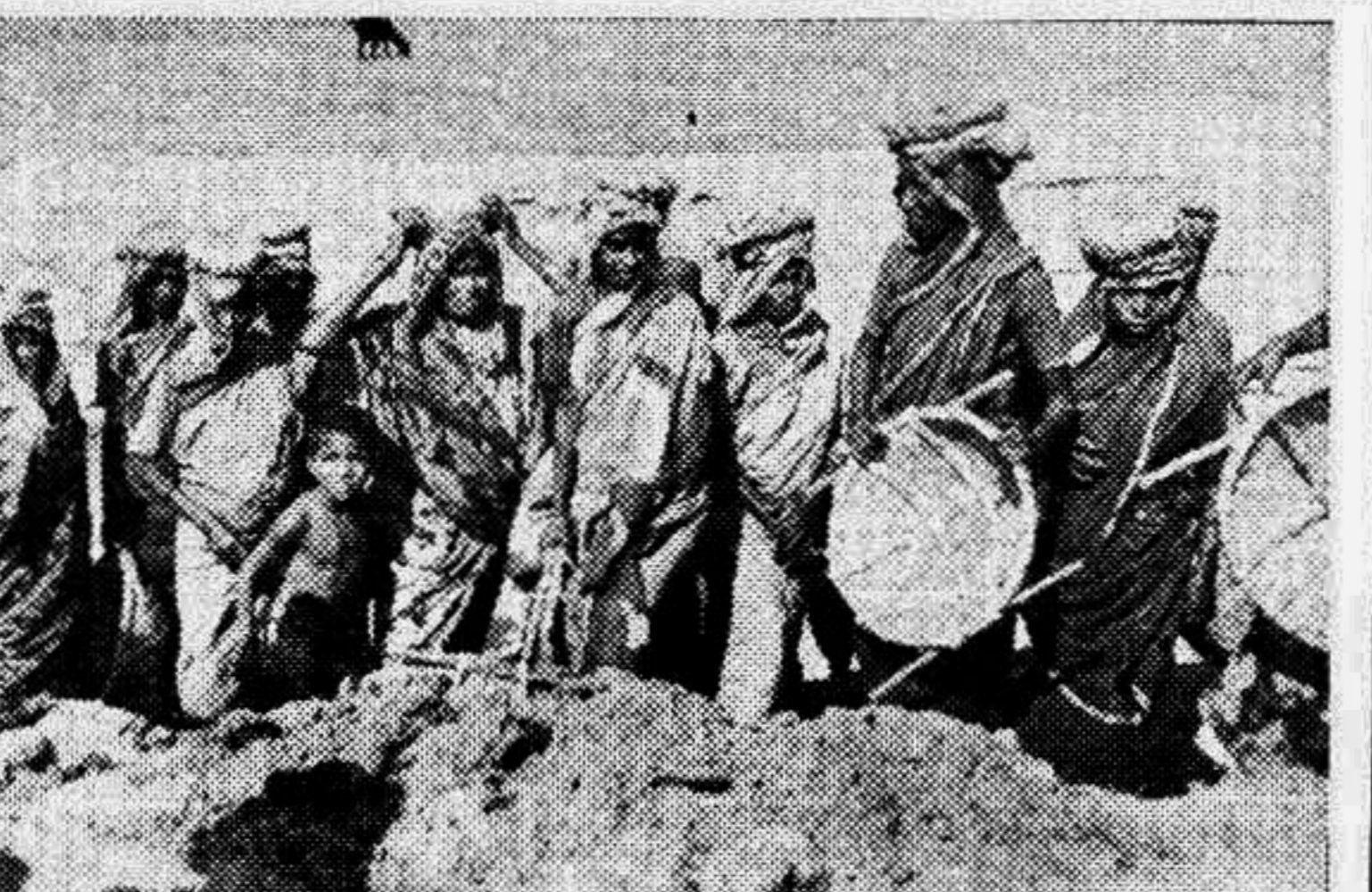
GAIBANDHA: Rural women are emerging as a new labour force in the northern region due to abject poverty and other reasons. Photo shows some woman labourers working at Kamardani in the sadar thana under Food for Works Programme.

Some farmers suggested that the government should procure potato like rice.