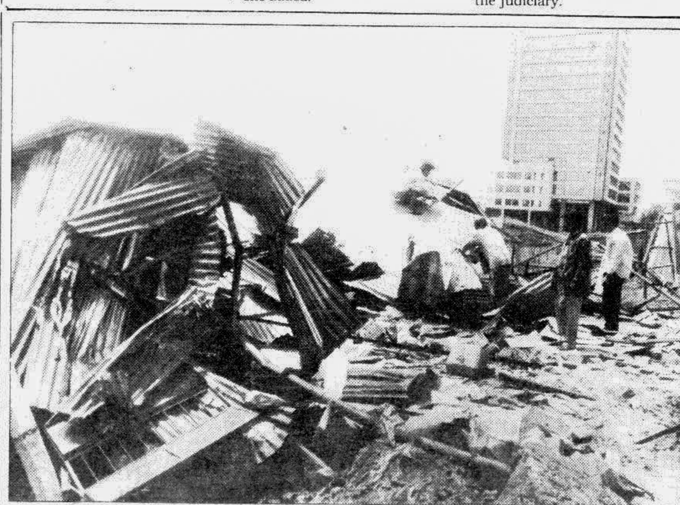
Rajuk drive underway yesterday to demolish unauthorised structures near the lake at Gulshan Section-I in the city.