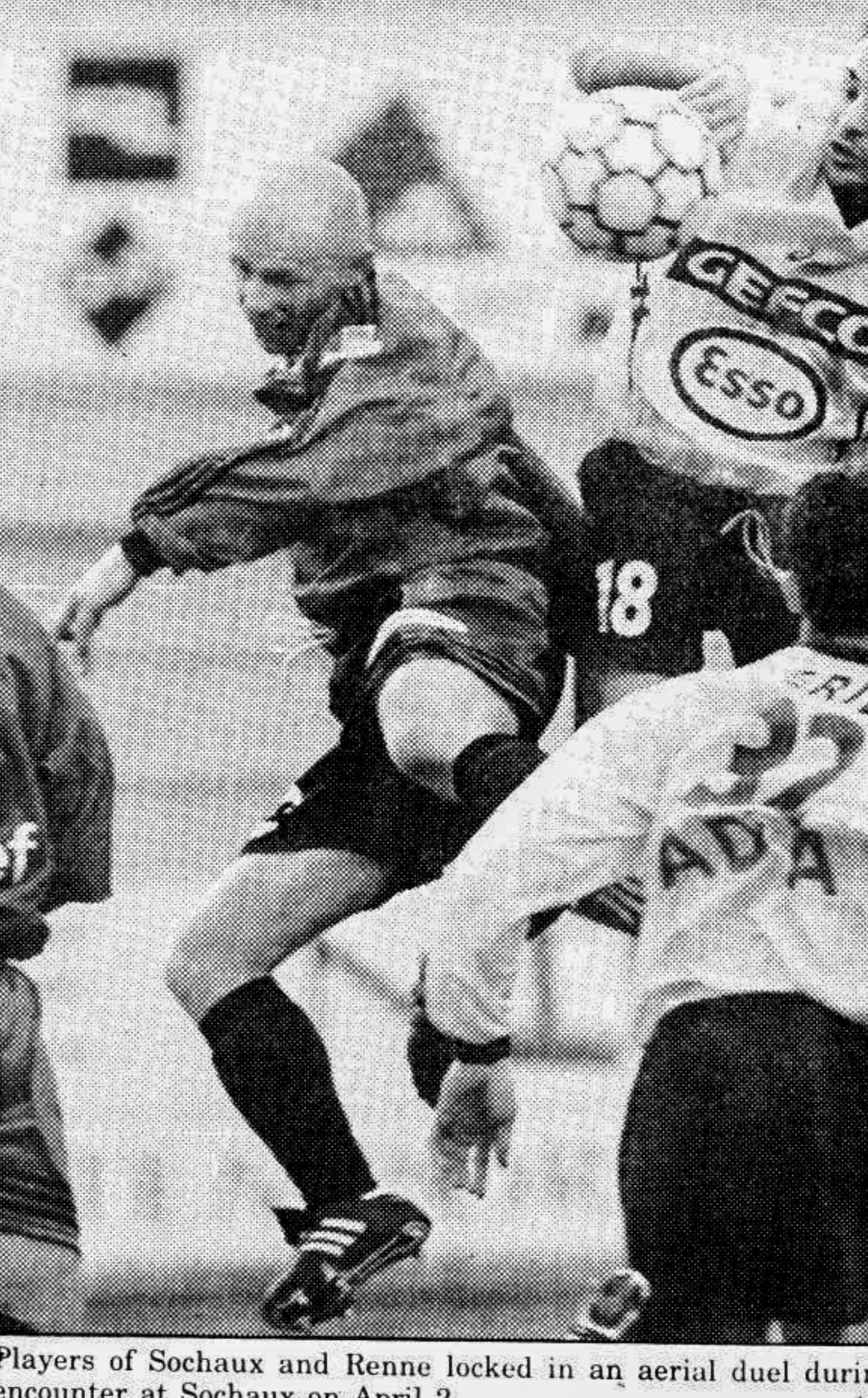
Players of Sochaux and Renne locked in an aerial duel during the French First Division encounter at Sochaux on April 2.

Such is the importance of success for the tournament that the Nigerian authorities consider making a few hundred people homeless a legitimate course of action. In short, everything has been done to camouflage the endemic poverty, crime and general degradation that threaten to blight Nigeria's moment of glory on the world stage. The visitors must not be allowed to see the true picture. Car-jackings, murders, street robberies, burglaries and assaults have become a chilling reality on the streets of Nigeria. Visitors driving alone are warned not to stop at traffic lights because of the inevitable threat of attack and venturing out alone is considered by many to be as good as asking to be robbed.