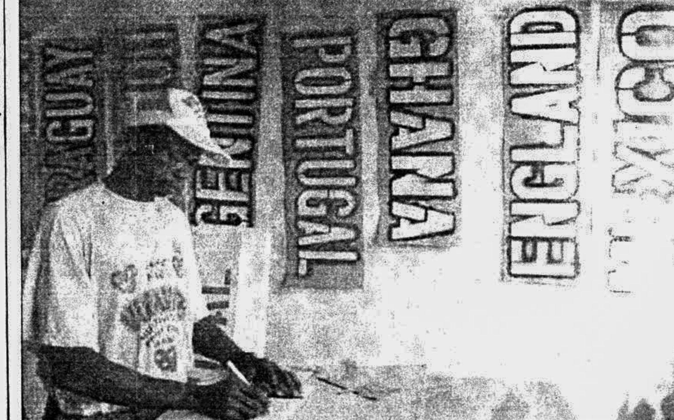
An artist writing down the names of the participating nations on placards on April 2 in Lagos prior to the opening ceremony of the World Youth Football Championships.

But, with major European clubs happy to buy talent from the most obscure nations, there will still be plenty to keep the agents happy.