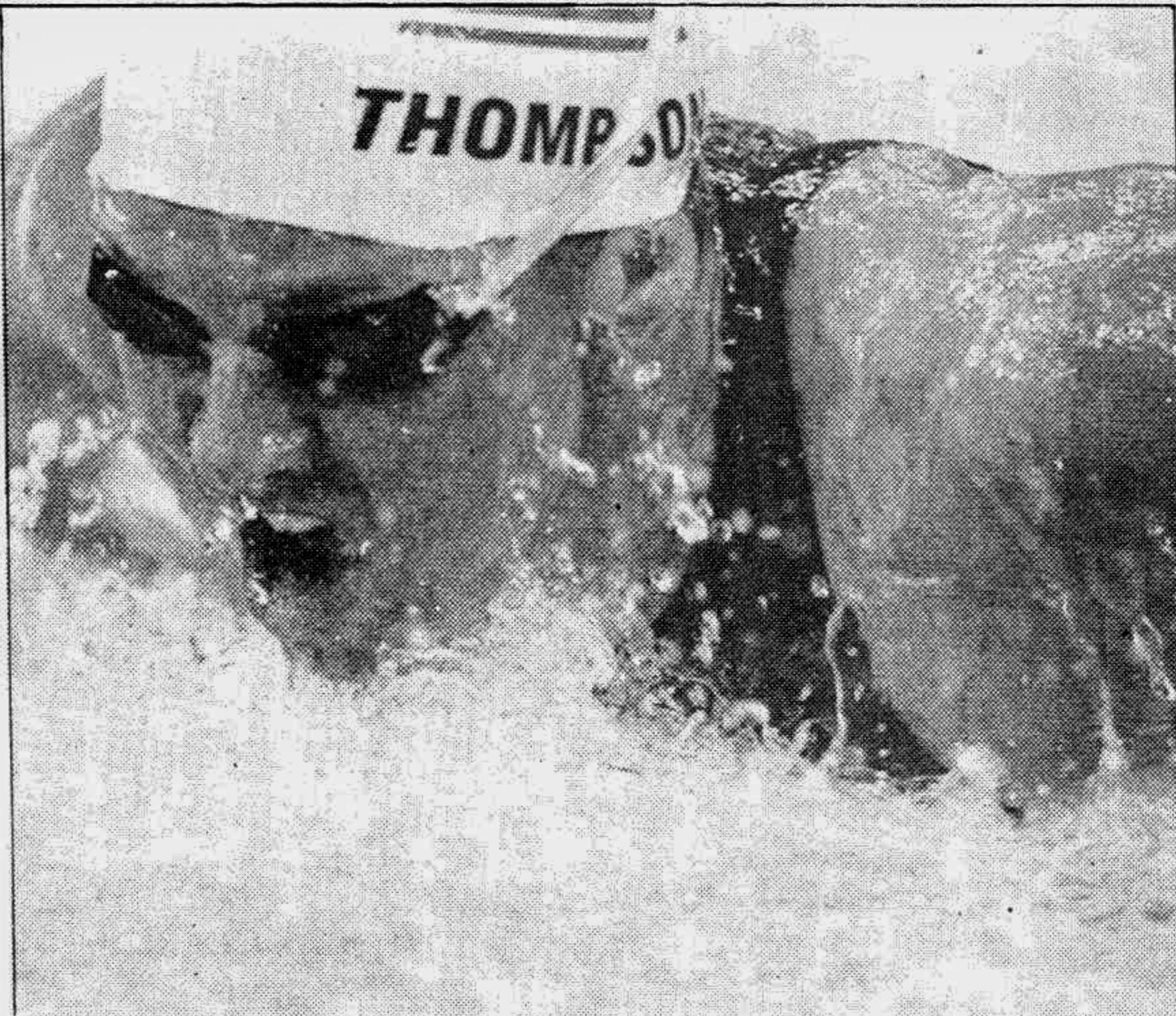
Jenny Thompson of USA, the world record holder in the women's 100 metres butterfly, in action during the heats at the world championships yesterday.

The master batsman, who batted for twenty minutes at the nets, said, "I have lost about six kilos and am feeling very well." Tendulkar was also seen holding his back gingerly after playing a couple of pull shots. Tendulkar, who looked "fit as a fiddle", said, "I have been doing some free hand exercises for the past two days and have lost some weight as well."