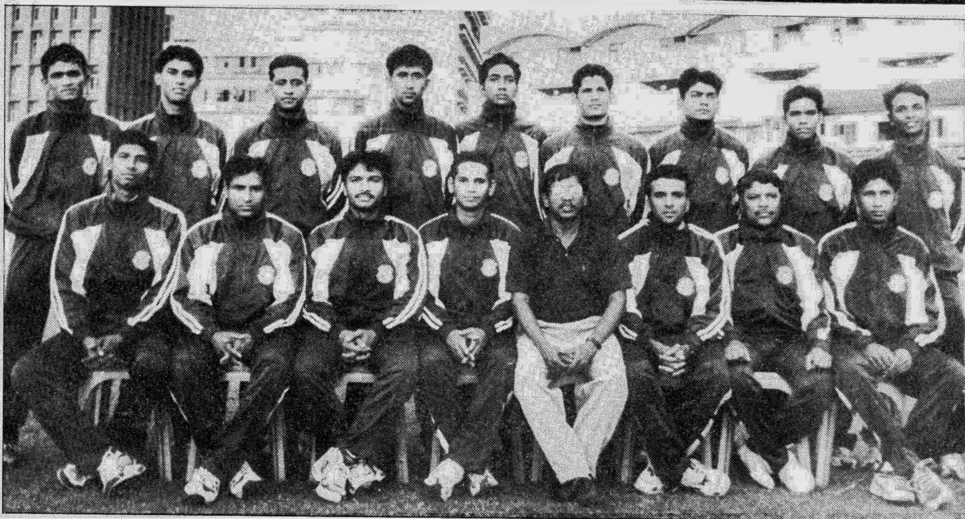
Players and officials of the BCB Eleven pose at the Dhaka Stadium yesterday.