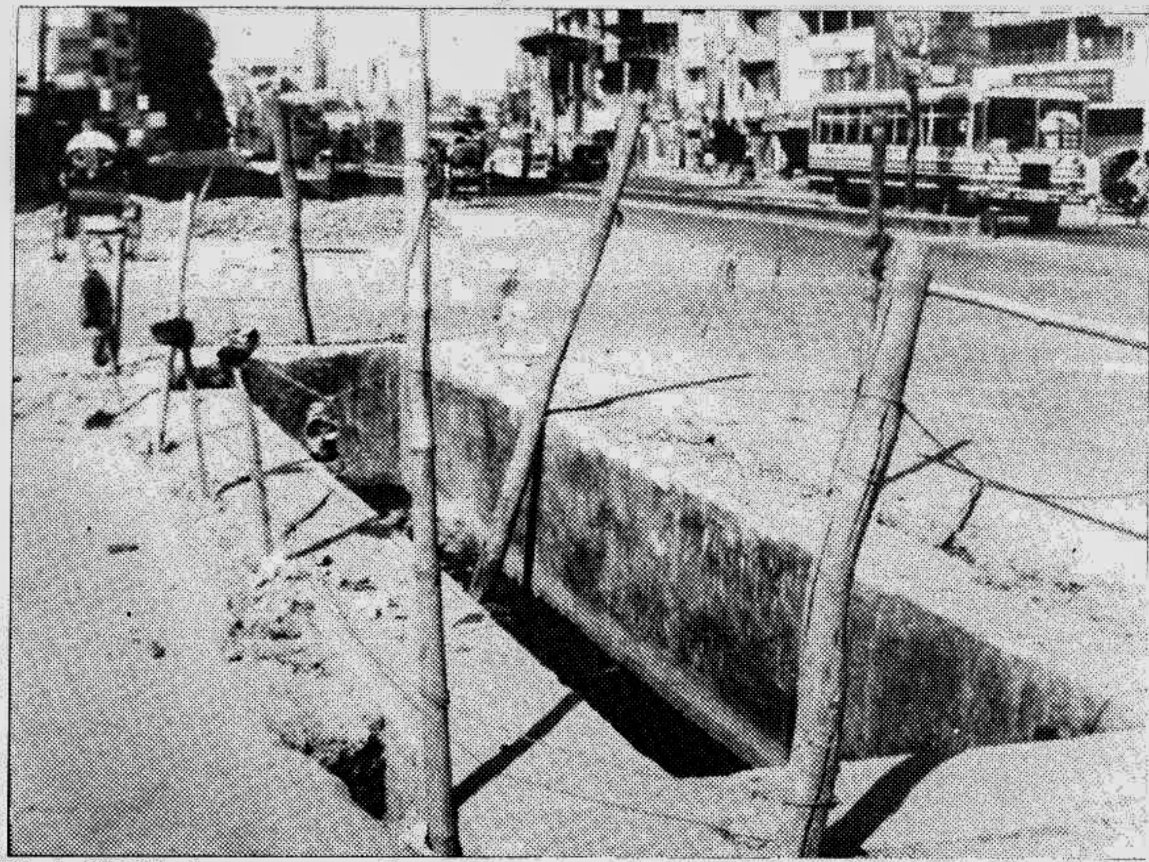
Dhaka WASA always seems to be working at snail's pace. This ditch was dug out for a drain near the Shantinagar Crossing long before Eid and still remains under construction, posing a constant threat to the users of the road.