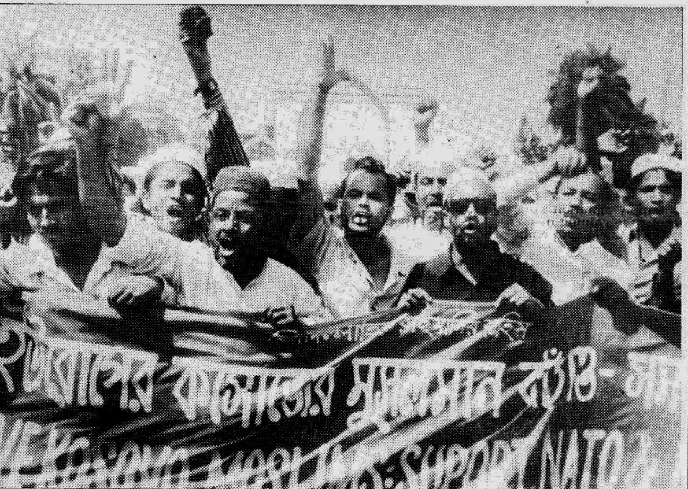
Bangladesh Democratic Party brought out a procession in the city yesterday to protest the killing of Kosovo Muslims by Serbian forces recently in Yugoslavia.

Russia has come under heavy criticism from the West for its help in building a nuclear reactor in Bushehr in southern Iran. The United States fears that Russia's assistance will help Iran develop a nuclear bomb, which Moscow denies.