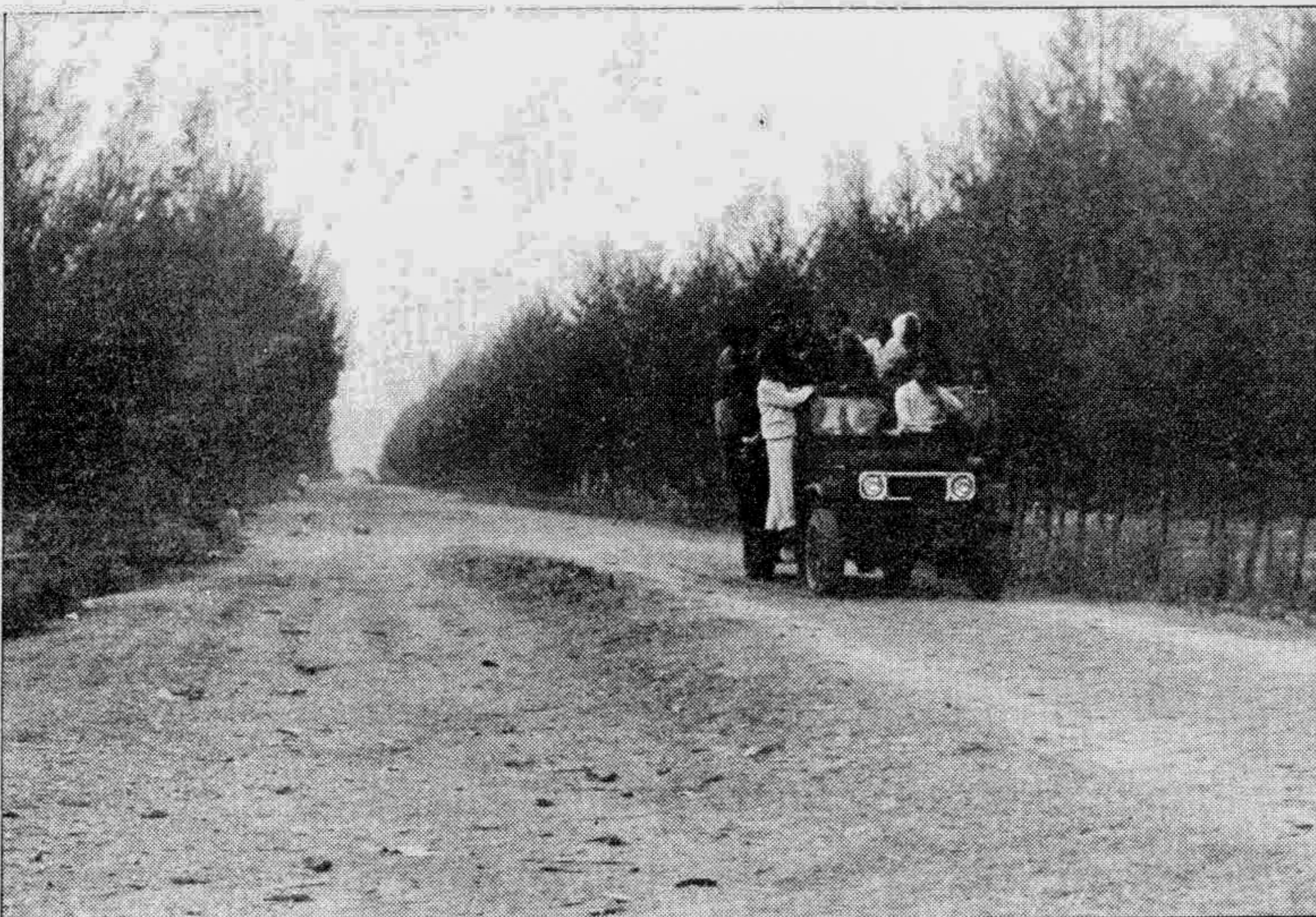
COX'S BAZAR: A new road along Cox's Bazar-Teknaf sea beach is now under construction for the recreation of tourists from home and abroad.