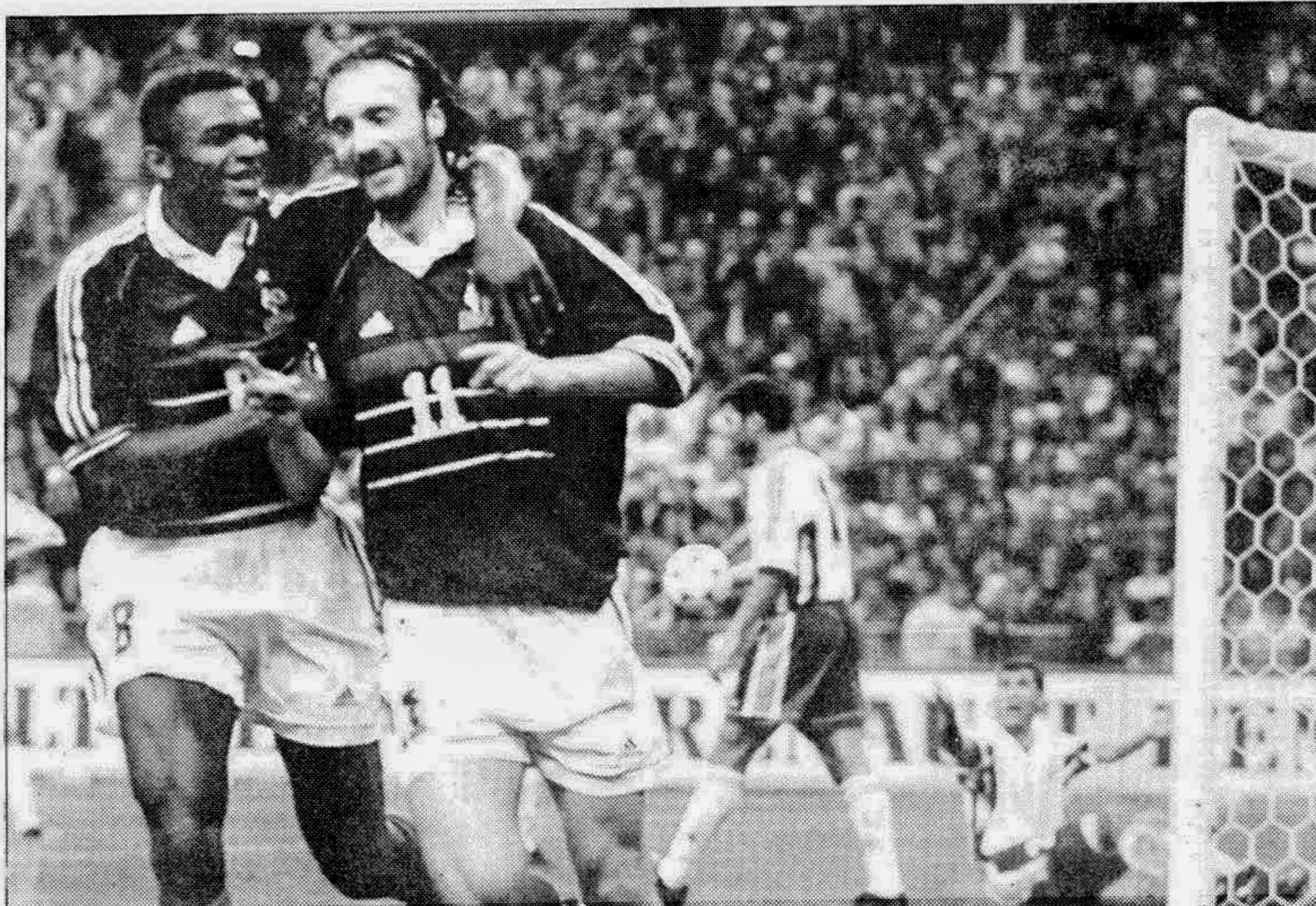
Striker Christophe Dugarry (No 11) being congratulated by France teammate Marcel Desailly after scoring the second goal in the world champions 2-0 Euro 2000 qualifying win against Armenia at Saint-Denis on March 31. France won 2-0.

Riots are common during Indonesian Football League matches where opposing soccer fans fight each other and vandalise their surrounding areas.