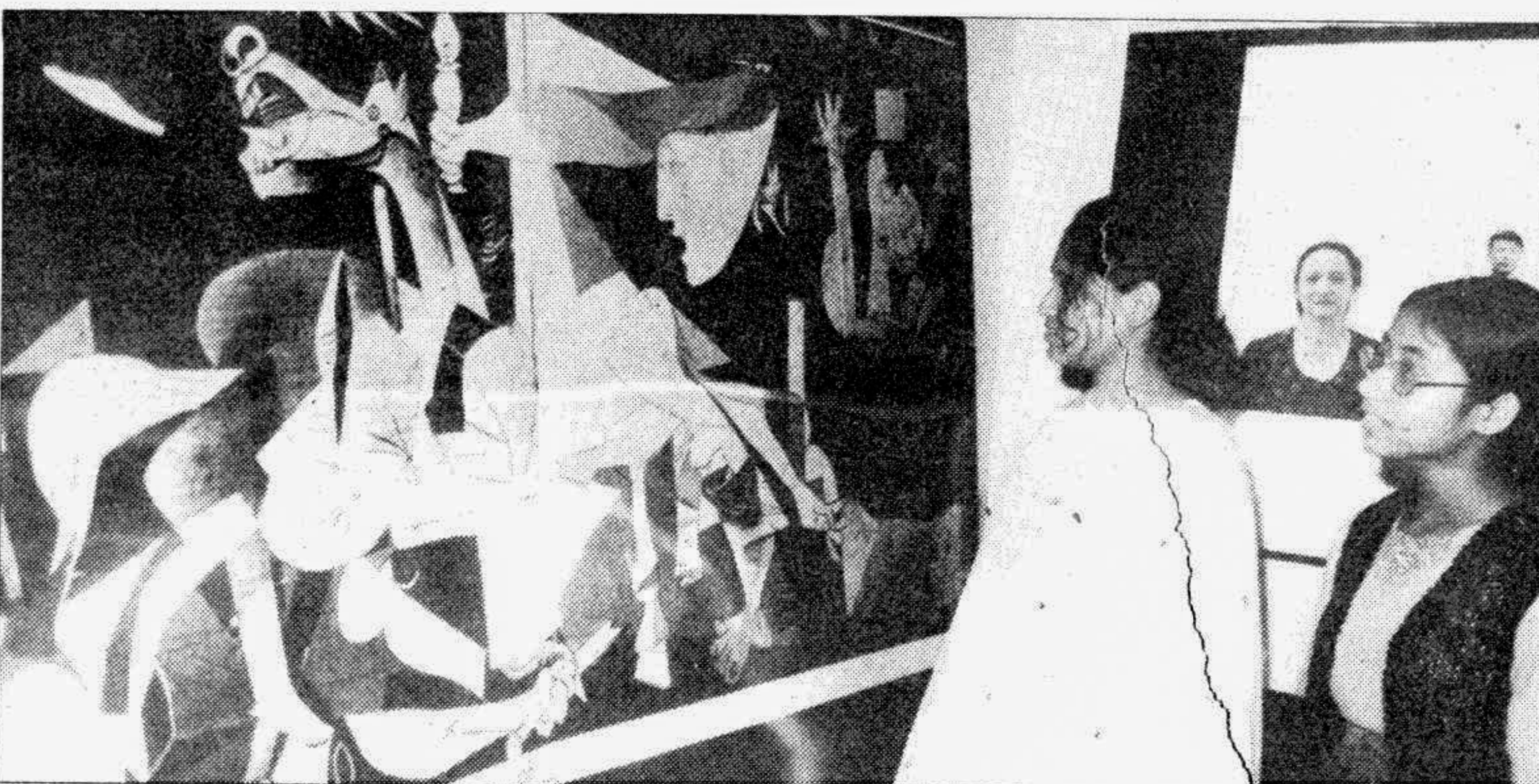
Visitors look at a poster of Picasso's Guernica at the poster exhibition at Alliance Francaise gallery.

Poster exhibition on human rights opens at Alliance Francaise