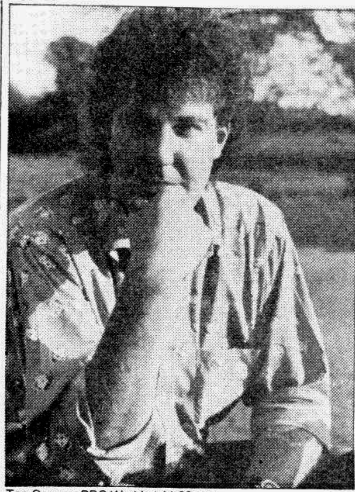
Top Gear on BBC World at 11:30 pm

7:00 Jagran 7:30 Zee News- Hindi 8:00 Help Line 8:30 Zee News- Hindi 9:00 Centre Stage 9:30 Zee News-Eng 10:00 Mystry Unfolds 10:30 Naye Nagme 1:00 Hum Zameen 11:30 Zee Business Update 11:50 Zee Business News 12:00 Bournvita Quiz Contest 12:30 Hasen Pal (Trailer Show) 1:00 Zee Countdown 1:30 Zee News- Hindi Bulletin 2:00 Ad Mad Show 2:30 Money Game 3:00 Teen Kaman 3:30 News Line 4:00 Aashiana 4:30 Hum Honge Kamyab 5:00 Naye Nagme 5:30 Zed it Pro 6:00 PurushKhetra 7:00 Hasen Pal (Trailer Show) 7:30 Zee Sports Show 8:00 The Diplomacy Show 8:30 Zee News- English 8:50 Zee Face To Face 9:30 Zee News-Hindi 10:00 Disha Samvad 10:30 Zee News-Hindi 11:30 Zee Business News-Seshan 11:30 Zee News Roundup 12:00 Zee Countdown 12:30 The Dream Marchant 1:00 Vision Beyond-50 1:30 BQC 2:00 Zee News- Hindi 2:20 Zee Face To Face 2:30 Hum Zameen 3:00 Zee News-Hindi 3:30 Beech Shahar 4:00 Hindi Feature Film (B/W)