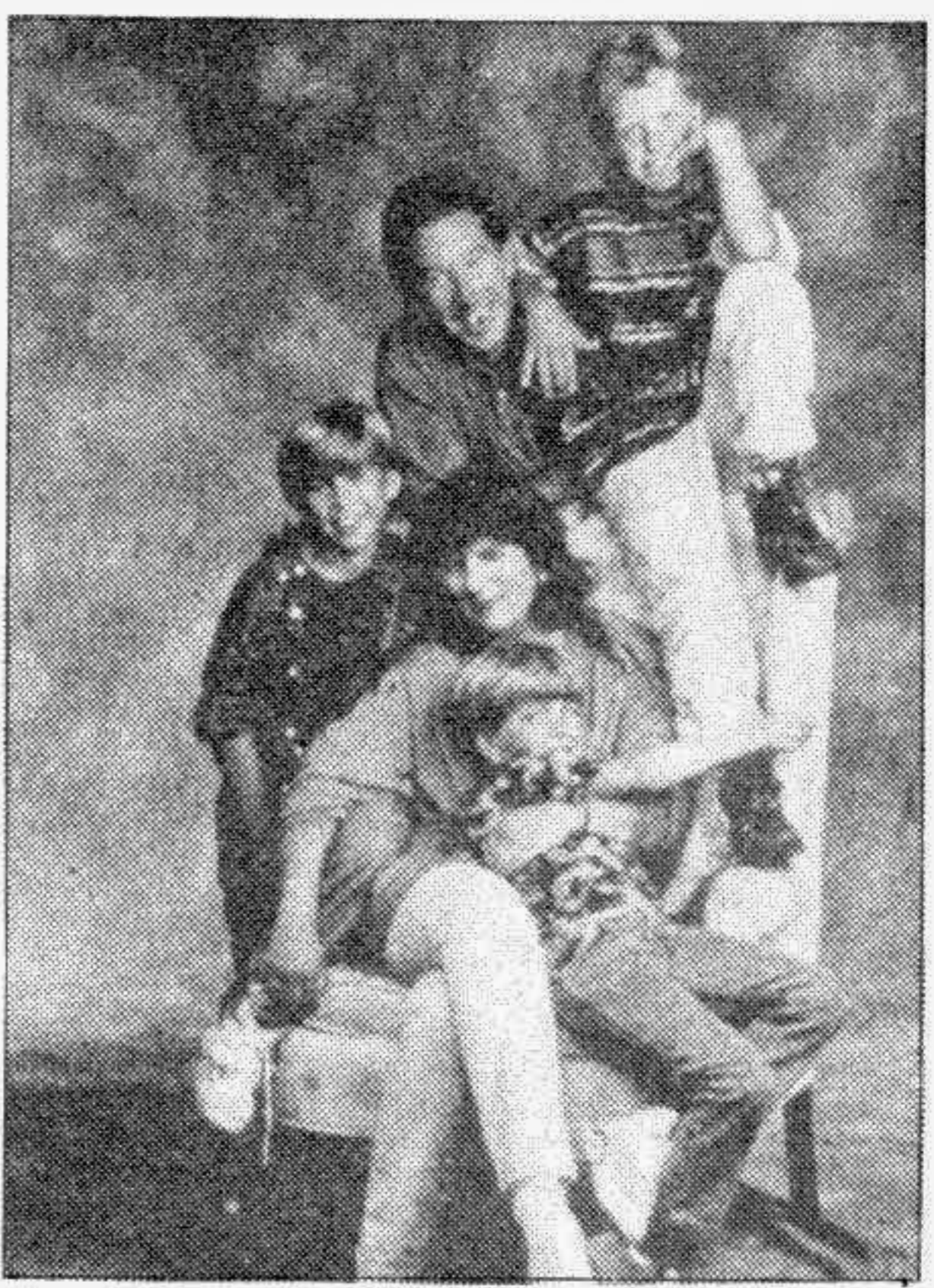
Home improvement on Star World at 9:30 pm

9:30 Opening & News in English 9:45 Business Plus 10:00 Chitrahari (Meet the Film Star) 10:30 Asian AM 11:00 Light Music 11:15 Suravi