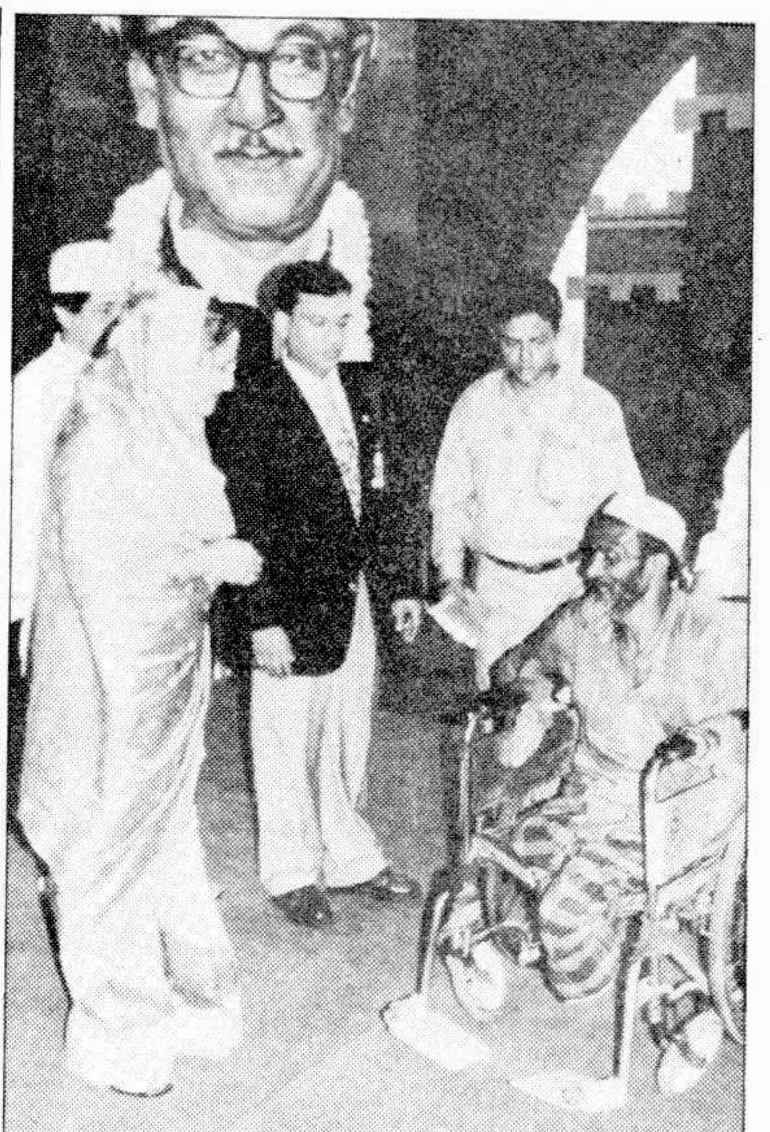
Prime Minister Sheikh Hasina exchanging Eid greetings with people from all walks of life at the Ganabhaban in the city on Monday.

Earlier, police had suspected the dead to be a DB source and that it could be somebody named Akhter or Mazfuz or Nurul Islam alias Nuru.