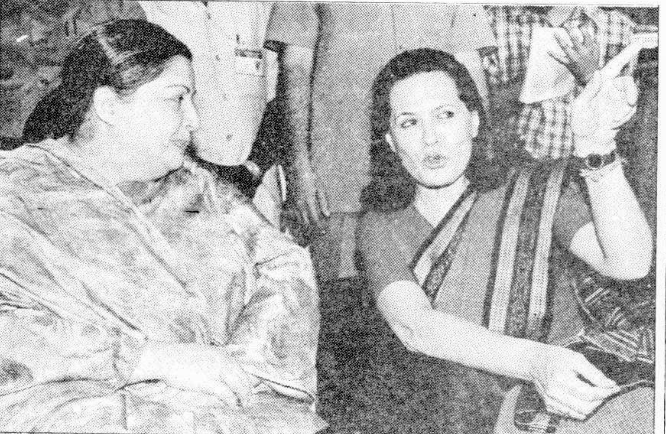
President of the opposition Congress (I) Party, Sonia Gandhi (R), gestures as she speaks to AIADMK leader Jayalalitha Jayaram (L) during a function in New Delhi on Monday.