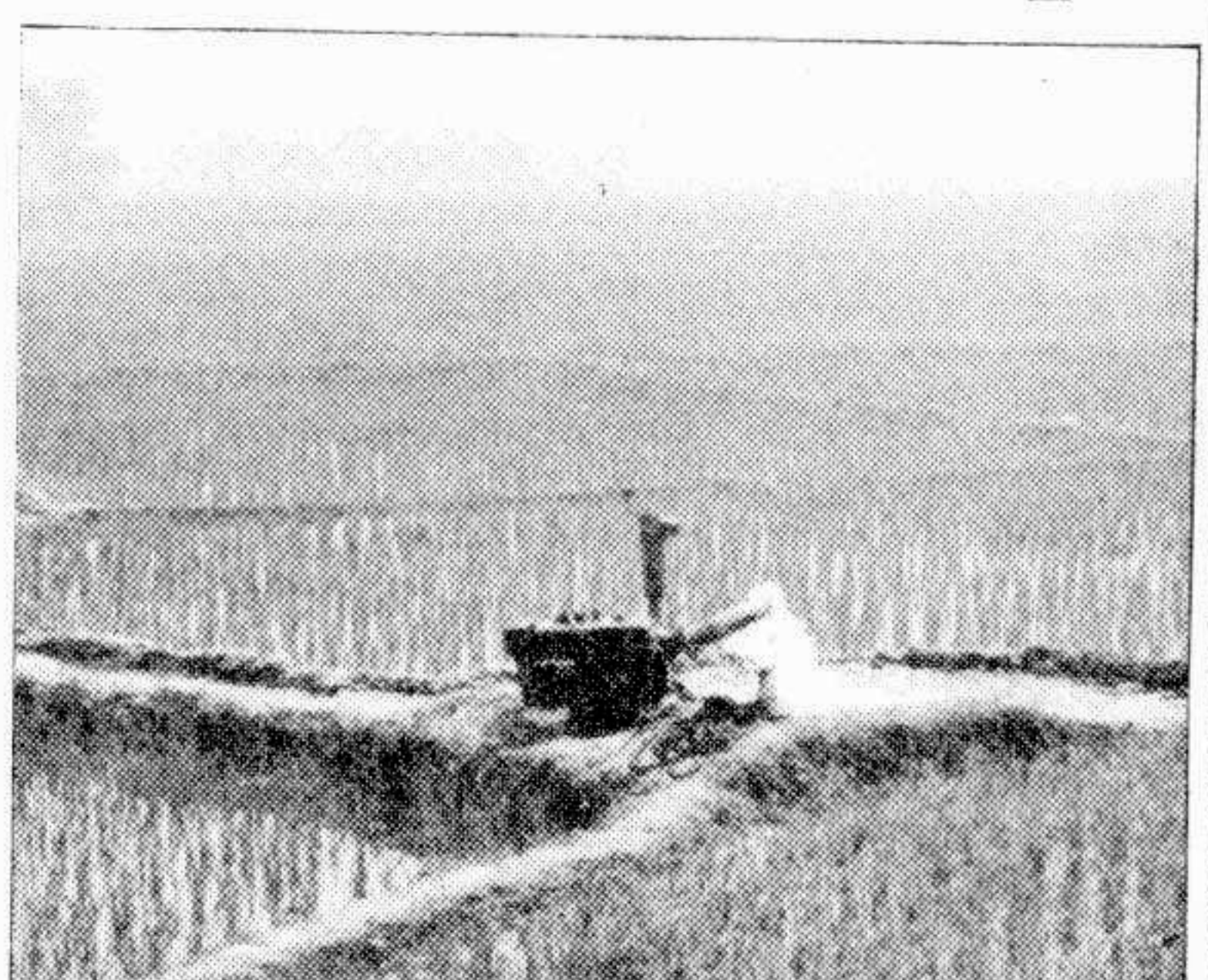
Boro fields in the northern districts are being extensively irrigated.

He said that farmers in the northern region had to pay more for urea as there was dislocation in fertiliser transportation due to hartals and unscrupulous traders tried to