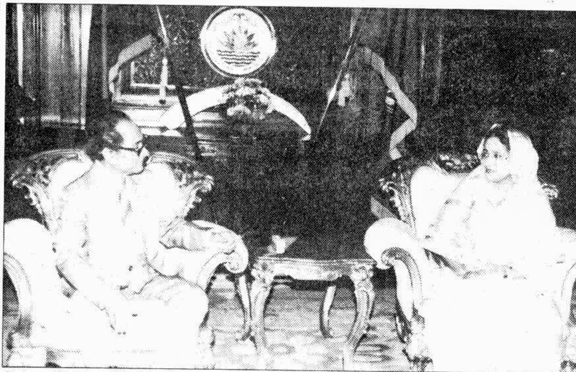
Prime Minister Sheikh Hasina exchanging Eid greetings with President Shahabuddin Ahmed at Bangabhaban on Monday.