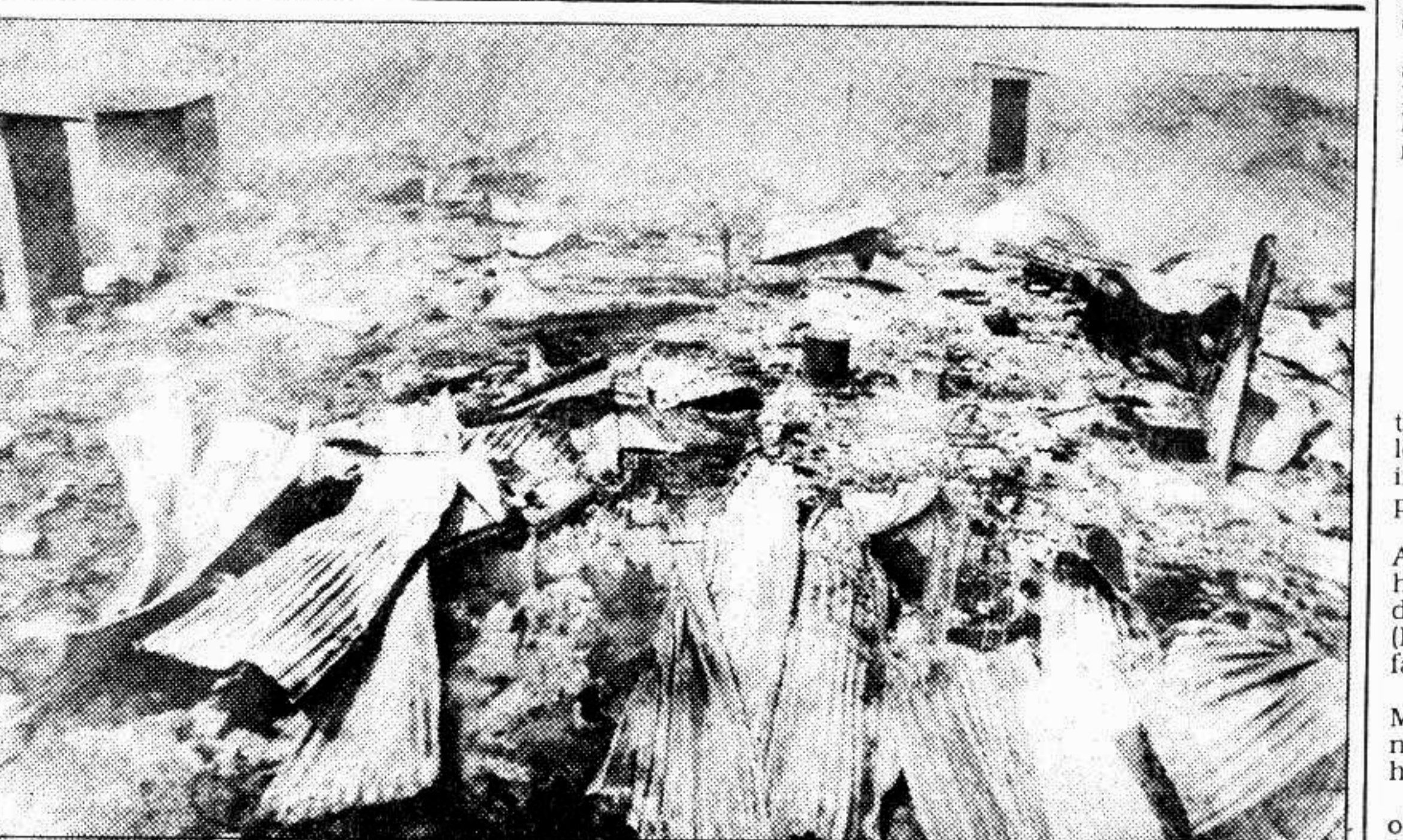
About one hundred and fifty thatched houses were gutted in fire at Kamalapur slum on Tuesday last.