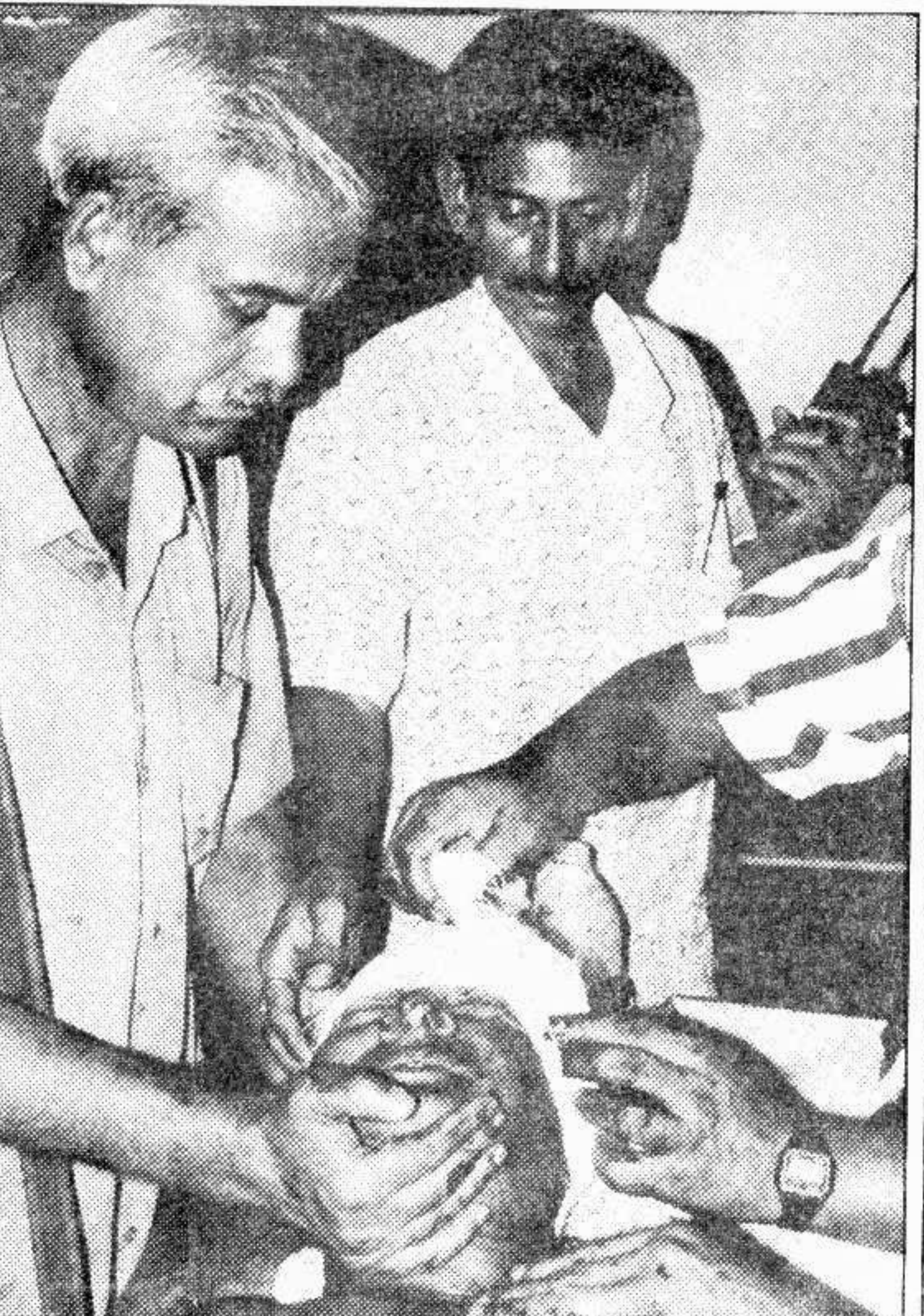
The ansar who was injured in a clash with muggers at Kaptan Bazar is being treated at the DMCH. A mugger was also killed during the clash on Sunday.