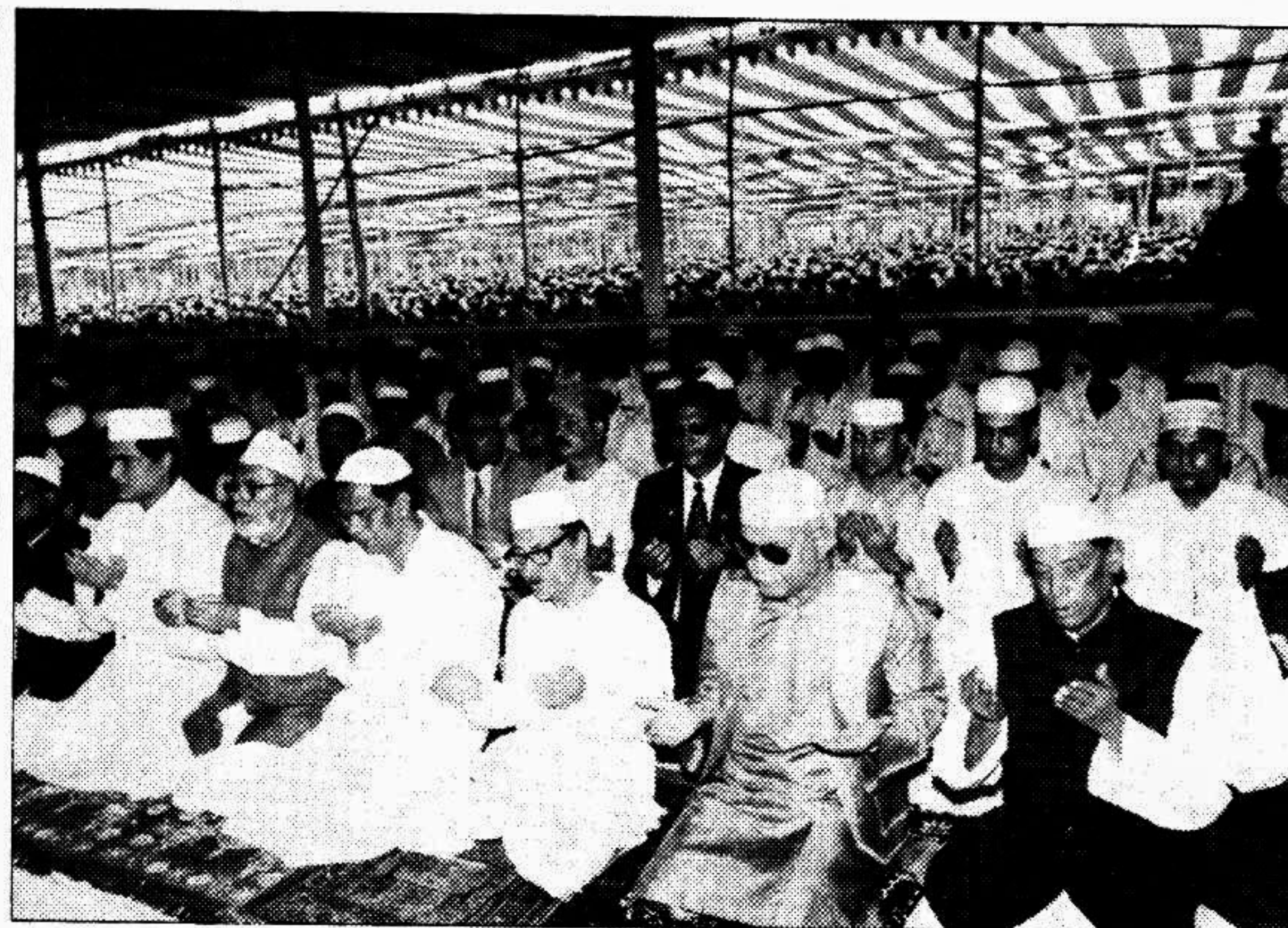
President Shahabuddin Ahmed offering his Eid prayers at the National Eidgah Maidan in the city on Monday.

BTV will also telecast live the final match of the tournament which will be held on Sunday.