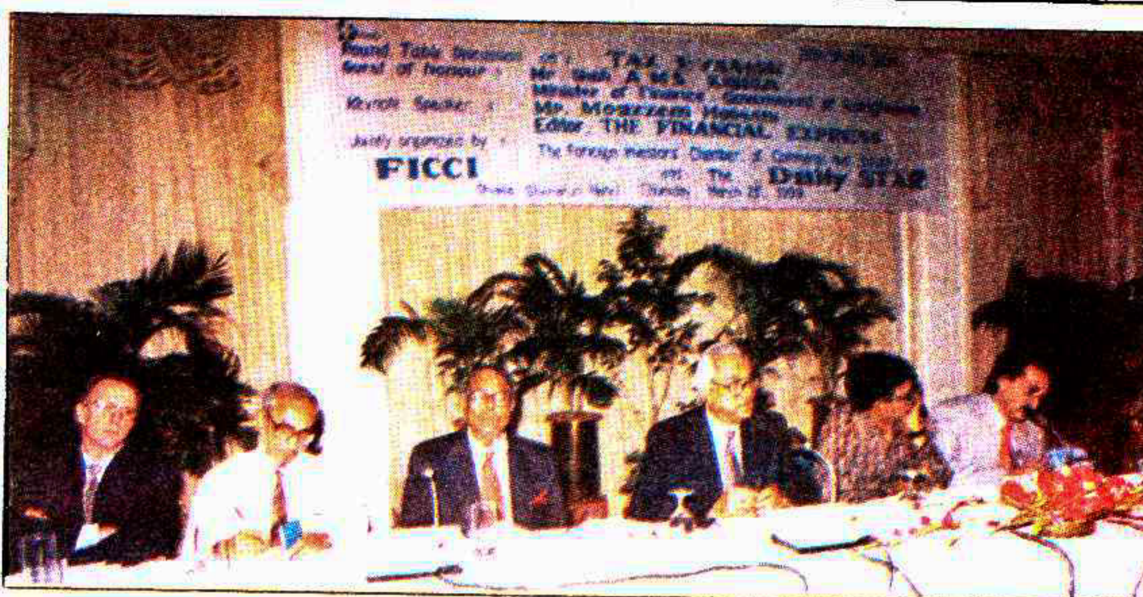
The Daily Star roundtable in progress.