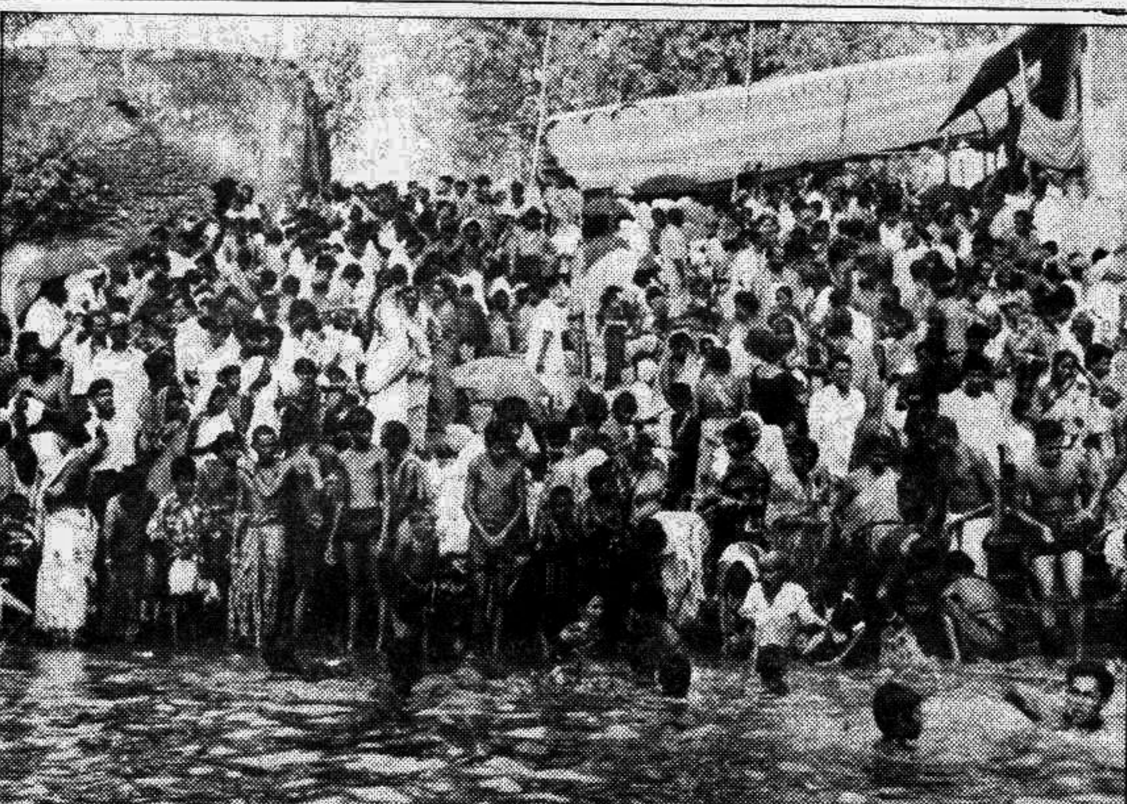
Hindu devotees taking dip during the holy bathing - the Astami Snan at Langalbandh yesterday.

A move is underway to amend laws of BSTI to enable the authorities to strictly prohibit malpractice, he added.