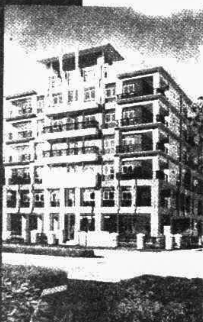
L.R. VILLA CONCORD