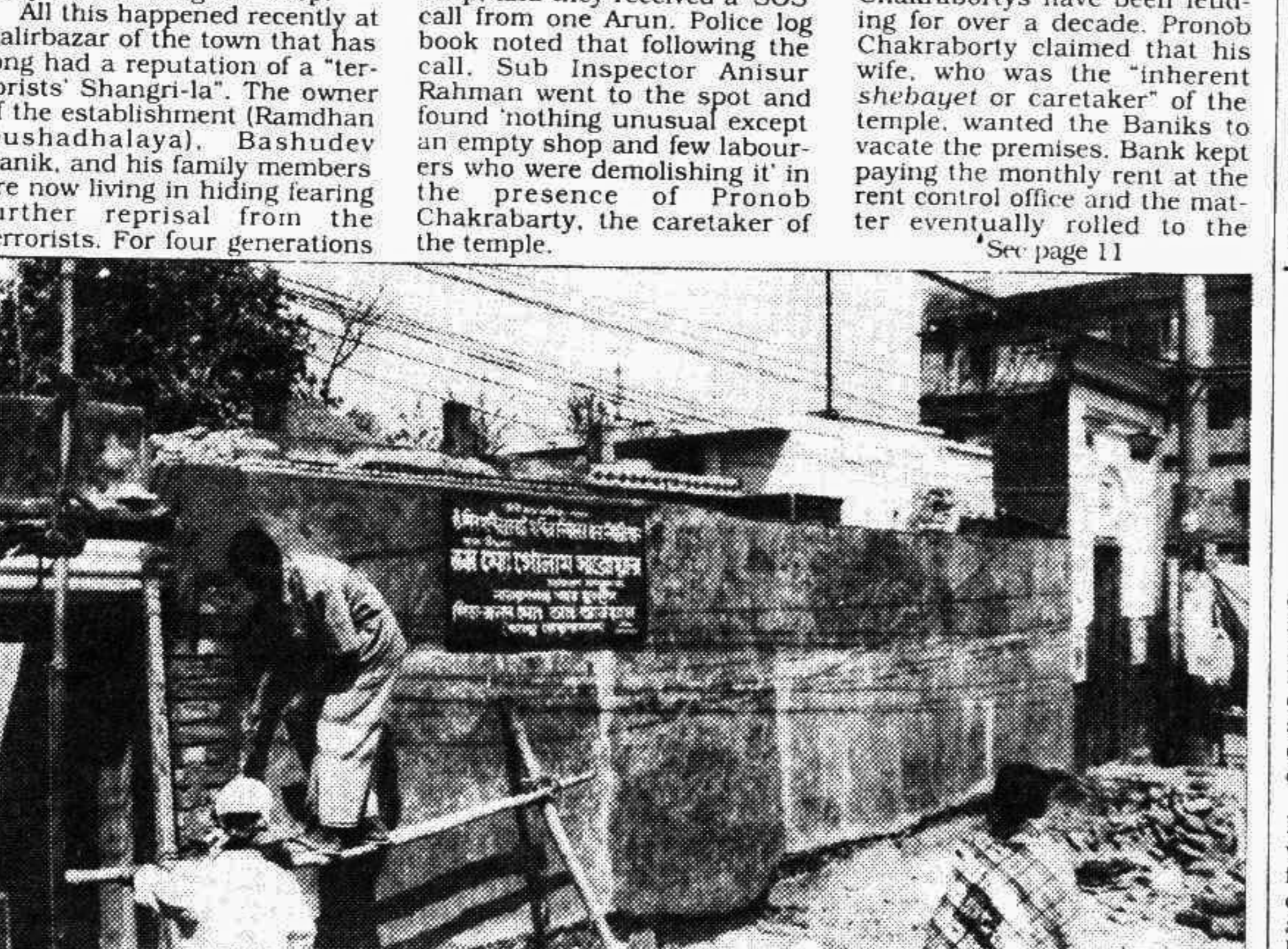
Workers constructing a high wall to seal off Bashudev's shop. The signboard gives credit to a local Jubo League leader for evicting the businessman.