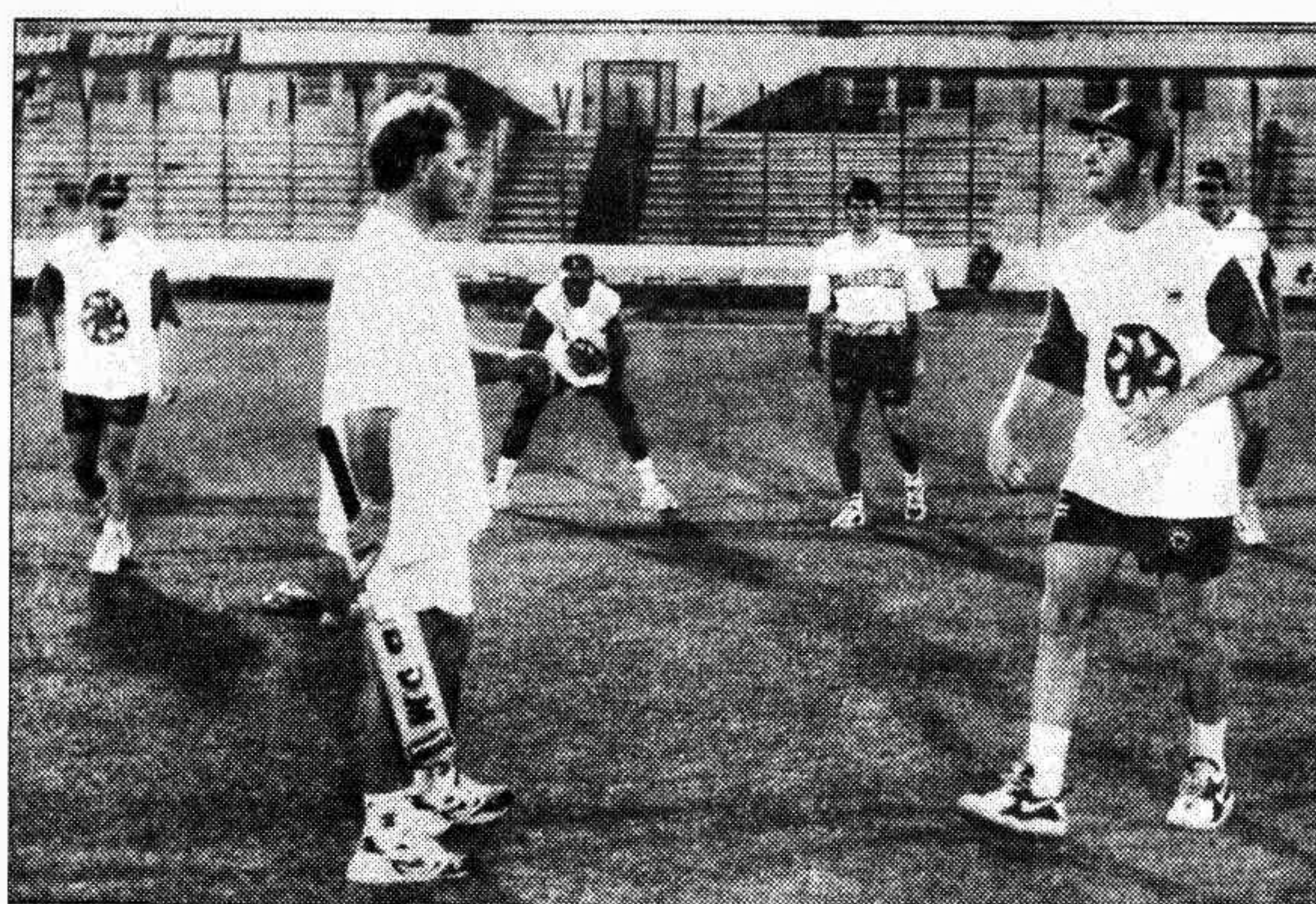
The Zimbabwe players honing their catching skills during a practice session at the Bangabandhu National Stadium yesterday.