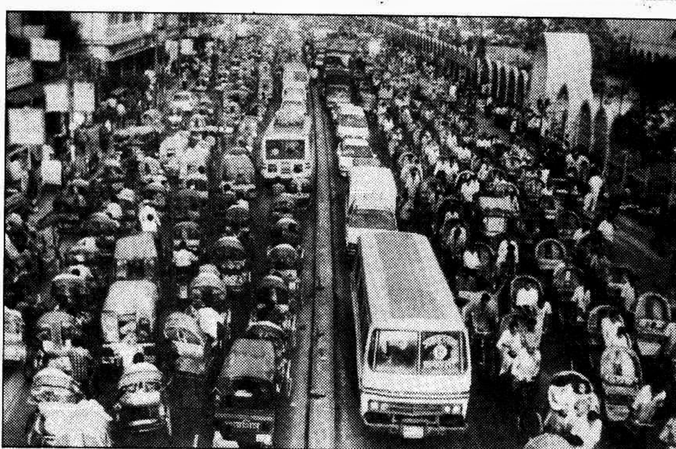
WHEN IS THIS GOING TO END? Traffic jams on the road leading from Dainik Bangla Square in Motijheel area to Paltan Square seem to be have become a regular pattern for almost the everyday. This has become a regular harassment for the drivers on this road who have to spend a miserably long period in the scorching midday heat. This snap was taken from the area yesterday noon.