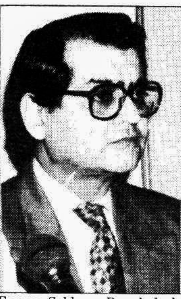
Farooq Sobhan, Bangladesh nominee

The prospects of Dhaka winning the prestigious position of Commonwealth Secretary General are bright, diplomatic sources feel. Former foreign secretary Farooq Sobhan is Bangladesh's nominee for the coveted post. Talking to The Daily Star on Saturday, Farooq Sobhan said the chances of Bangladesh's being elected to the position "are definitely bright" since 50 out of 54 members of the Commonwealth are developing countries. Only Britain, Canada, Australia and New Zealand are developed countries and the rest are developing nations of Asia and Africa. "There is a strong feeling among most of the Commonwealth nations that the next Secretary General should be from an Asian developing na-