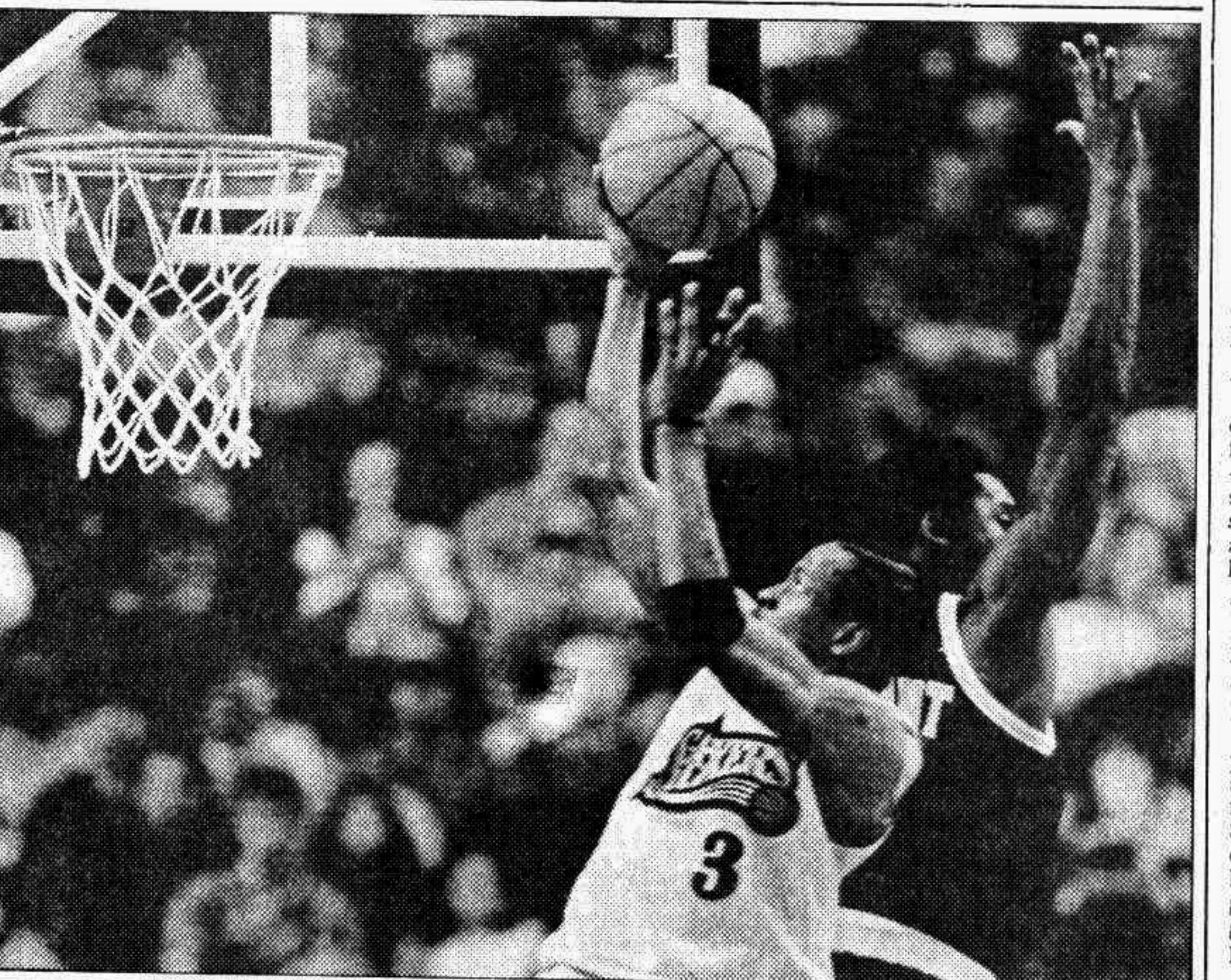
Action from the NBA game between the Philadelphia 76ers and the Los Angeles Lakers in Philadelphia on March 19.

"The little kid was phenomenal," Sixers coach Larry Brown said. "At one point I had to take him out he was so wired. He took a lot of shots, but he had good selection on most of them."