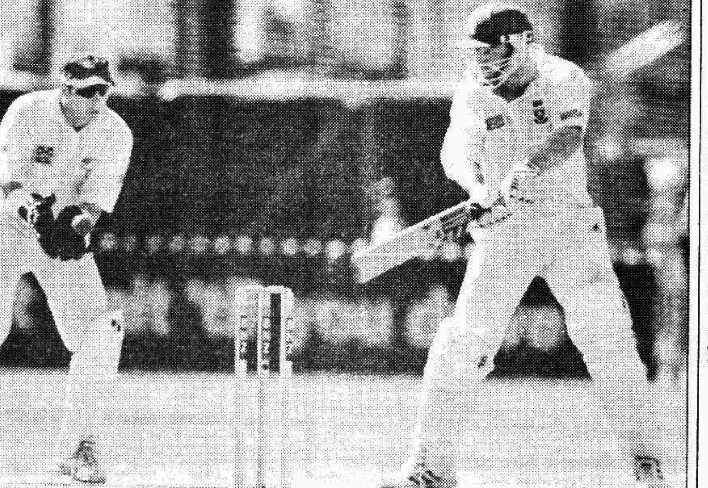
South Africa captain Hansie Cronje plays a cut-shot on the third day of the third Test against New Zealand in Wellington yesterday.