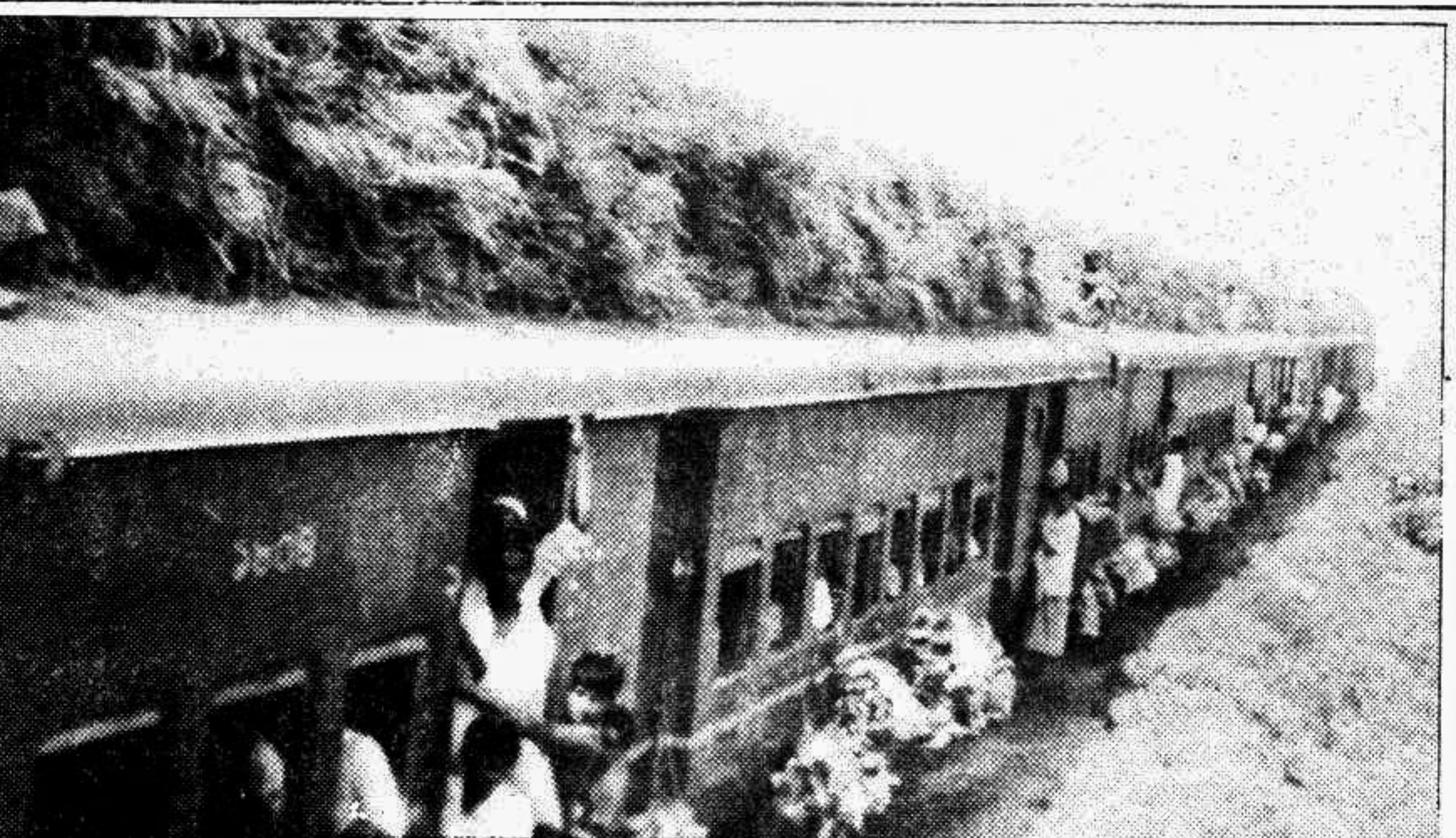
GAIBANDHA: Train journey has become hazardous now. Photo shows a train which was fully loaded with passengers carrying fodder on its rooftop and firewoods along its windows.

Meanwhile, one of the inmates went out of the house and shouted for help for the villagers through the microphone of the mosque against the dacoits. The dacoits then resorted to firing and four persons were injured. The injured were Shamsuddin, 50, Wahab, 50, Monir, 8 and Tahmina, 6. They have been admitted in Kushtia General Hospital.