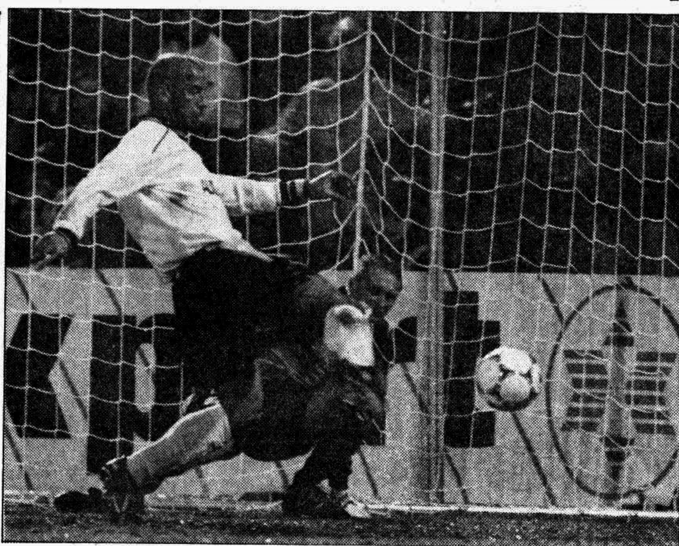
Chelsea player-manager Gianluca Vialli places the ball into the Valerenga net to score his team's first goal in their European Cup Winners' Cup quarterfinal second leg encounter at Oslo on March 18.