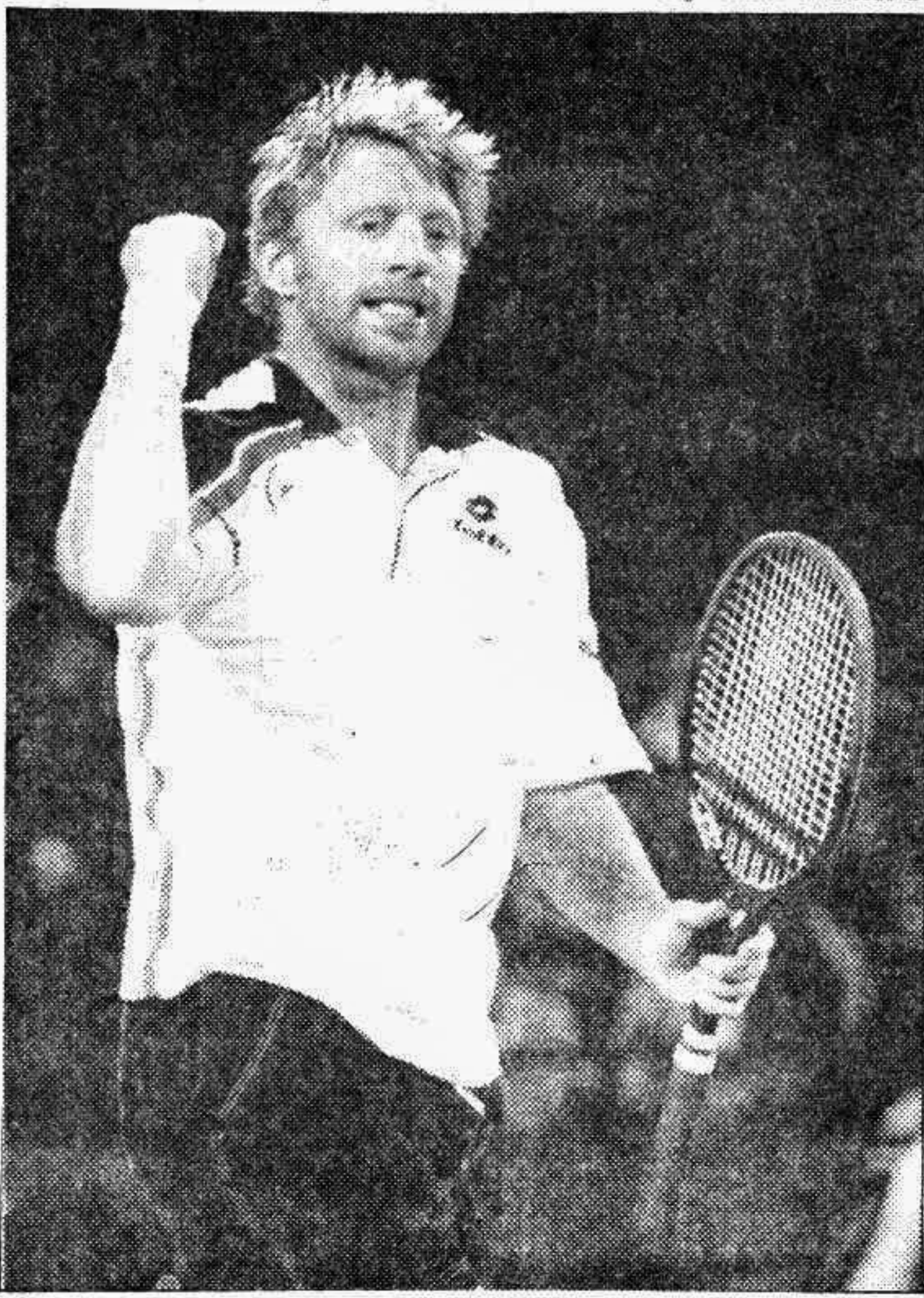
German Boris Becker is delighted after recording his first round victory in the Lipton Championships in Florida on March 18.

first in the United States since the 1995 US Open.