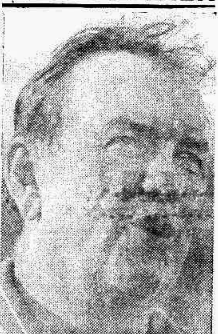
Bob Simpson (Former Australian cricket team coach)

'Australia have wisely gone for the two leg-spinners, Shane Warne and Stuart MacGill. There is no doubt in my mind that they will play major parts in Australia's victory in the West Indies.'