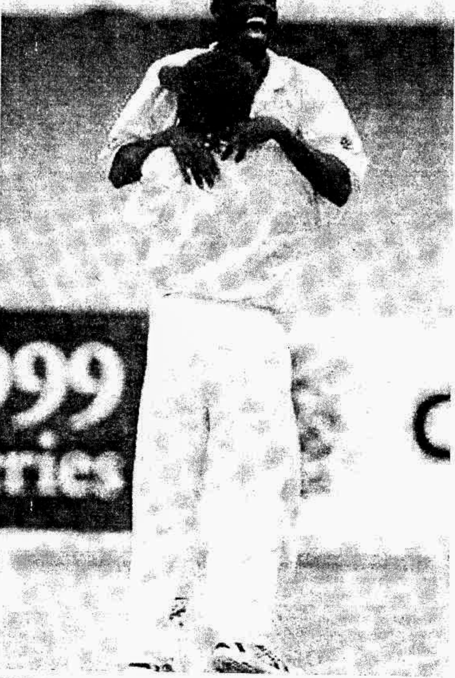
BRILLIANT DEBUT: A smiling Nehemiah Perry being hugged by captain Brian Lara after taking one of his five Australian wickets on Monday.

Healy was run out for the second time in the match and Waugh's resistance was ended by a delivery from Walsh that reared awkwardly, leaving