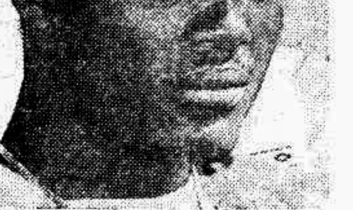
LARA ... m-o-m

Australia's leg-spinners then snapped up the remaining four wickets. Shane Warne taking his first of the series and Stuart MacGill getting the other three, including the last with his first delivery after lunch.