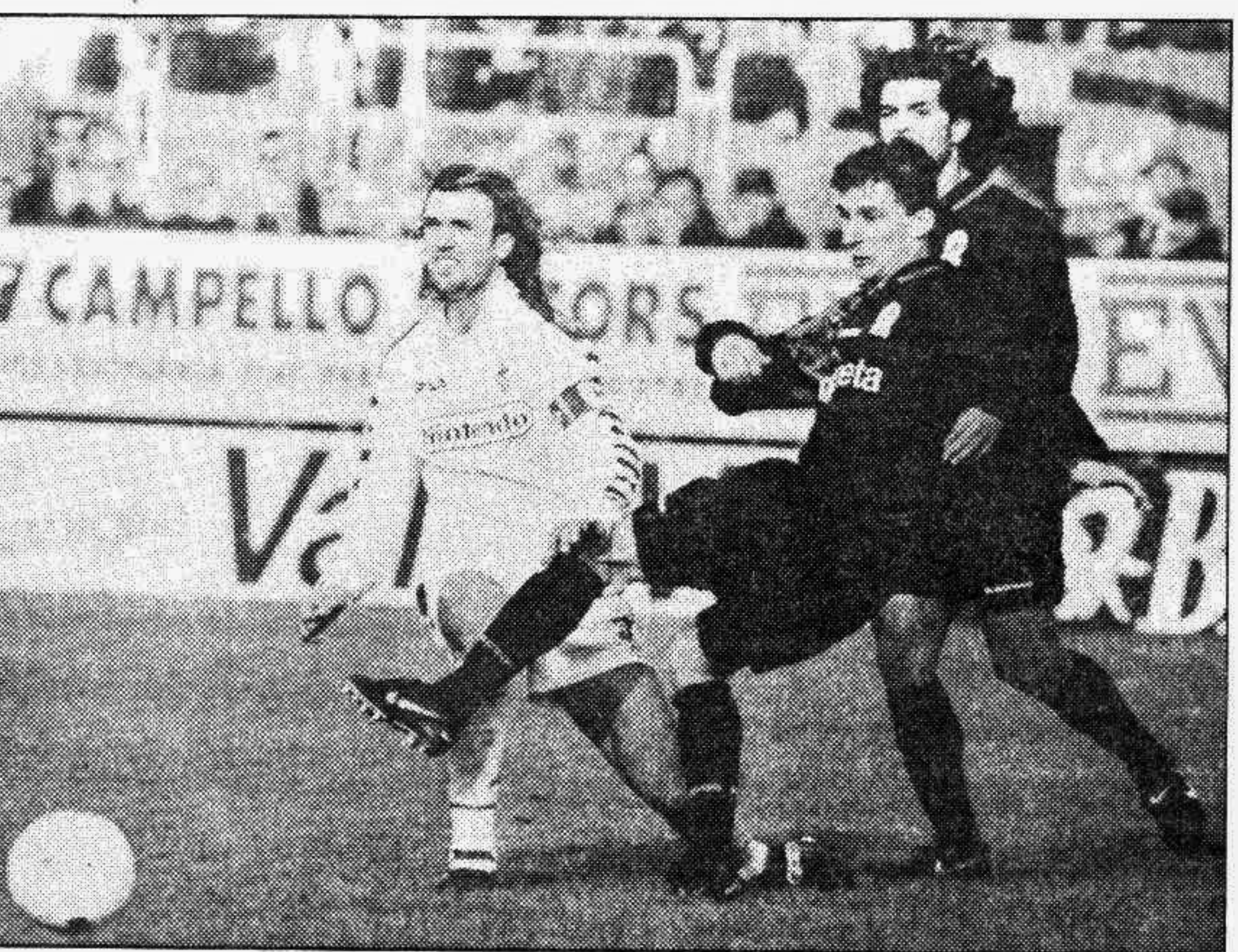
Fiorentina's Gabriel Batistuta (L) being challenged by two Venezia defenders during their Serie A match at Venice on March 14. Fiorentina were shocked 1-4.

Interested clubs have been asked to enlist their names with Bangladesh Sishu Kishore Krira Unnayan Tahlil by March 25.