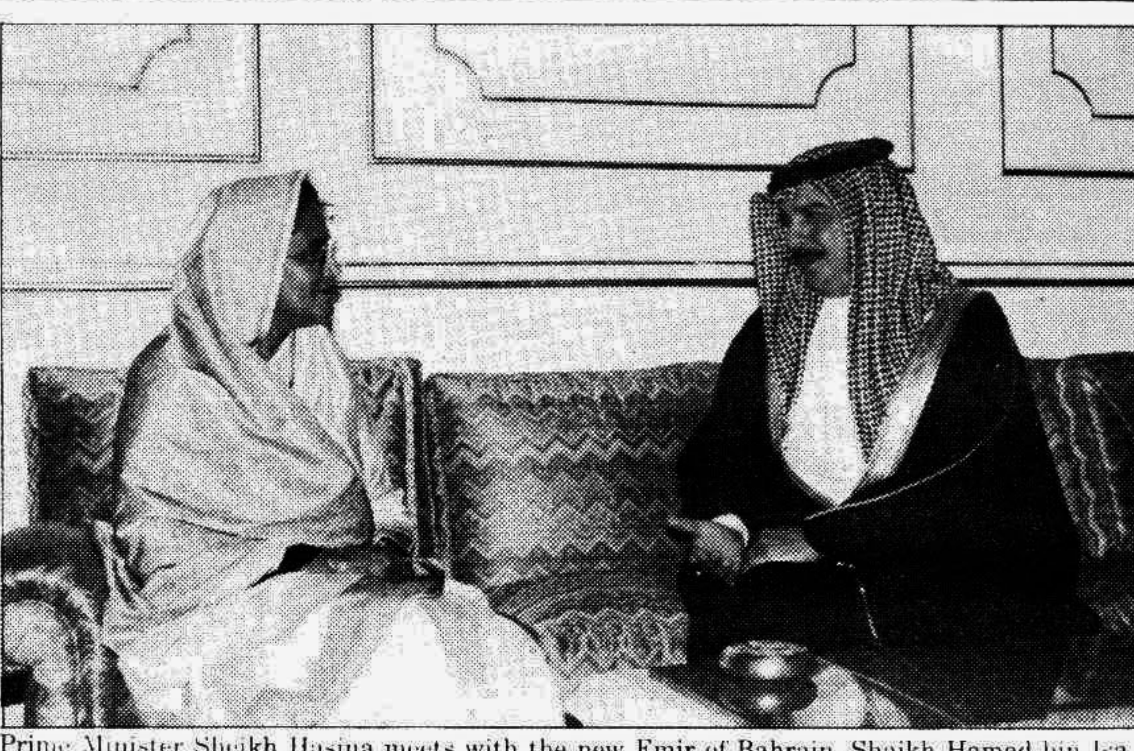
Prime Minister Sheikh Hasina meets with the new Emir of Bahrain, Shaikh Hamad bin Isa Al-Khalifa, during her visit to the Middle Eastern nation.