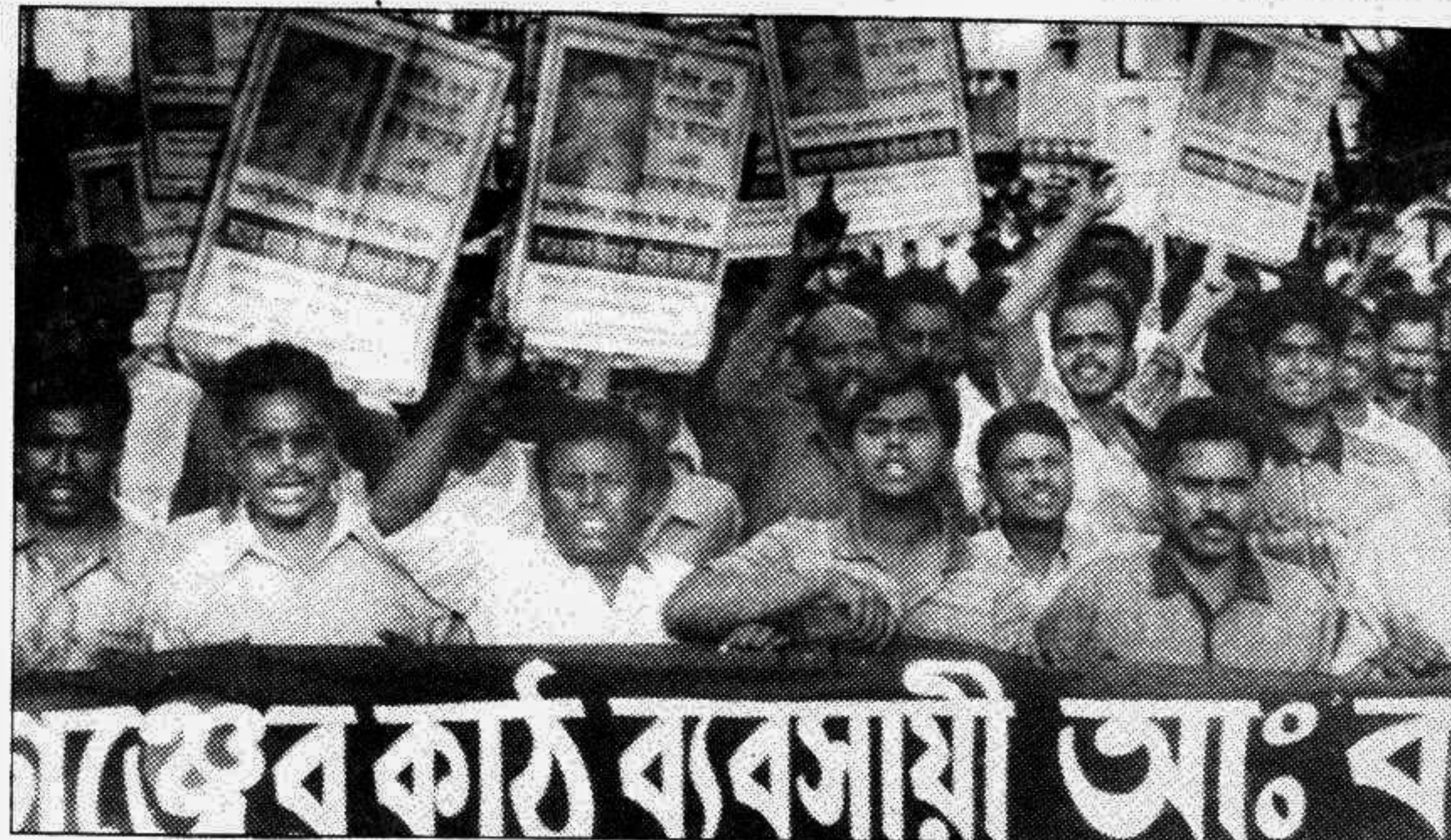
Timber traders demonstrating in the city yesterday to protest the killing of a trader in Keraniganj.