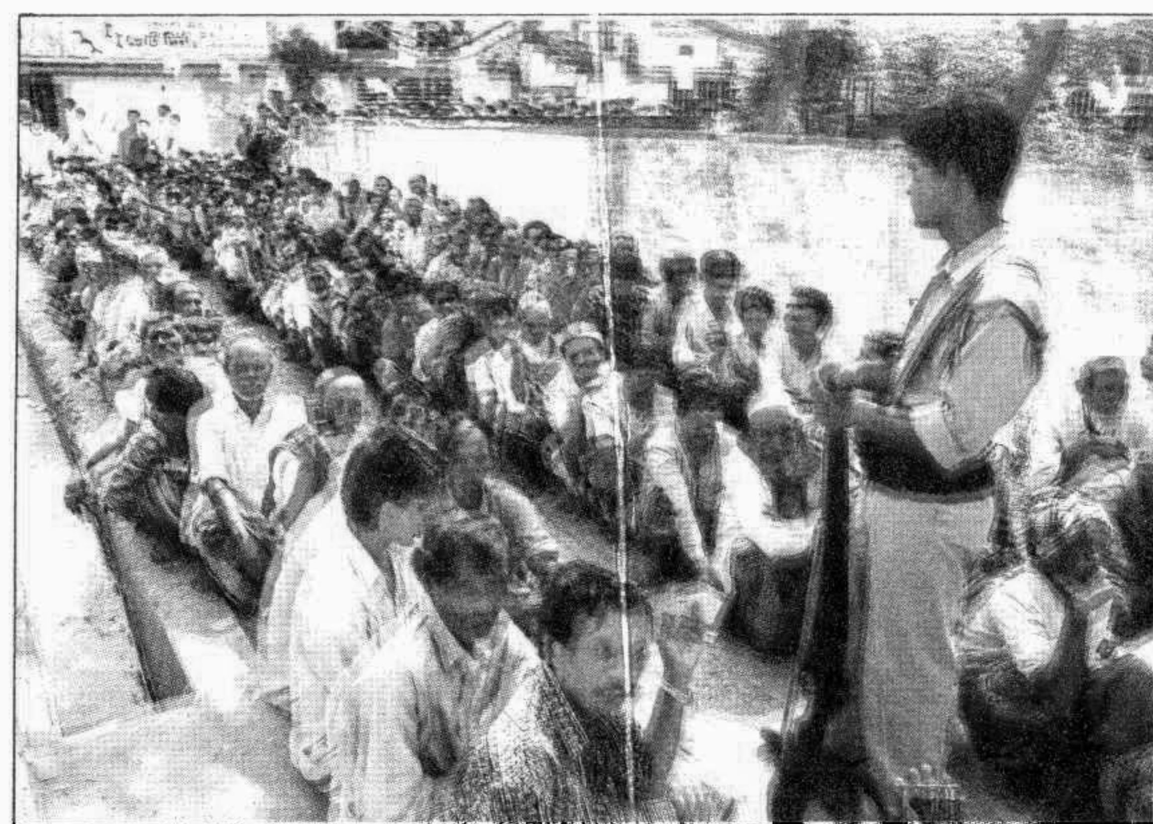
Voters waiting to vote in the Adamjee Jute Mills CBA elections. The picture was taken from the canteen of the No.1 mill, now being used as a polling centre.

Earlier, on her arrival at the Manama International Airport the Prime Minister was received by Minister for Commerce Ali Salah al Saleh and Electricity and Water Minister Abdullah Mohammad Juma.